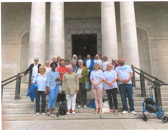
Valleys Re-Told at Cardiff Museum