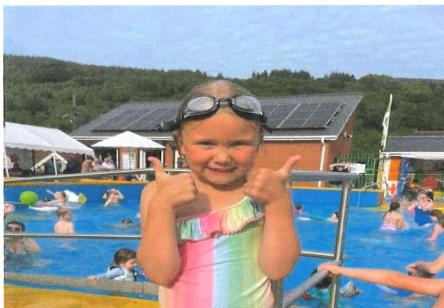
Pool Season Summer 2023

Below are a few photographs to demonstrate some of our activities.