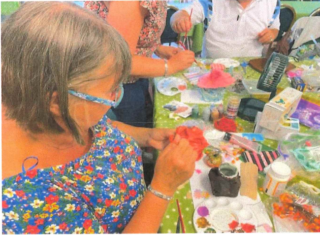
Cosy Cwtch Crafters