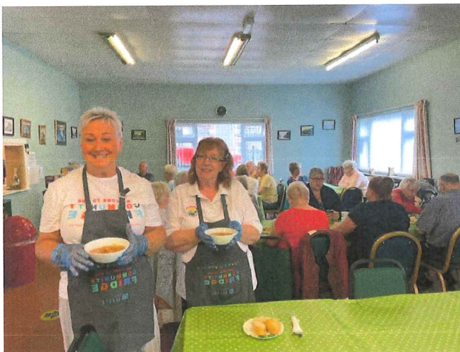
Cosy Cwtch Warm Hub