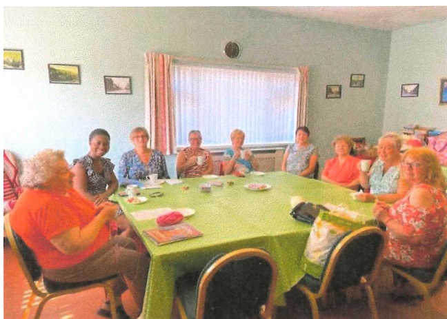
Knit & Natter