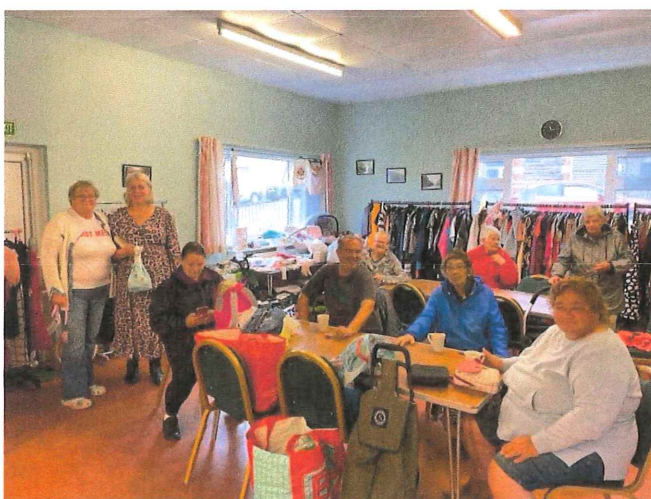
Table Sale & Drop-In