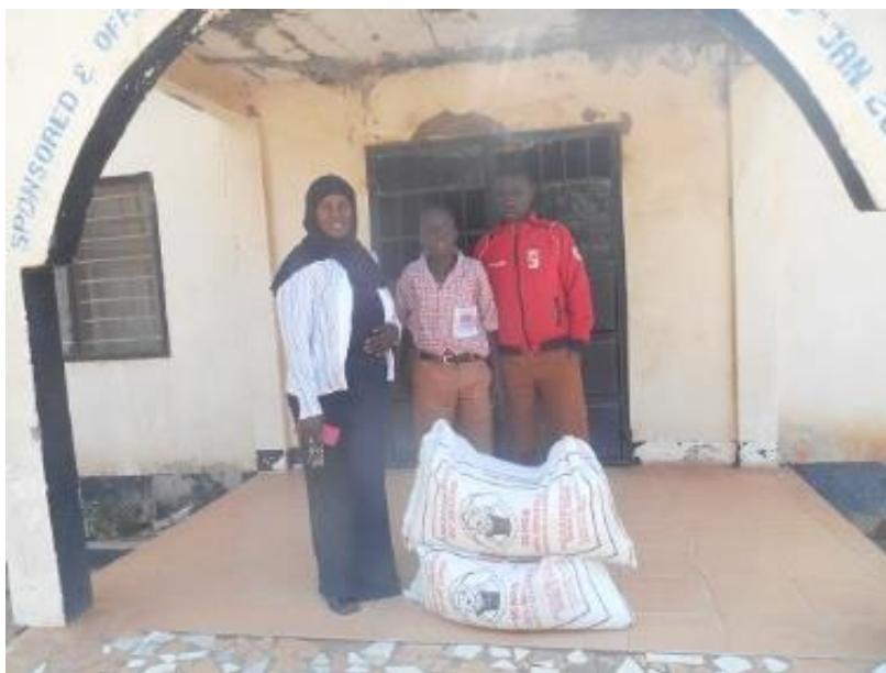
Rice delivery to GOVI school for the Blind

The Sponsorship Scheme is intended to support students in State schools up to Grade 12. However, some sponsors continue to support their students if they go on to further education.