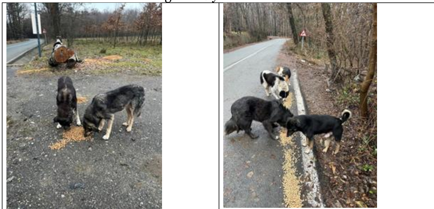
Abandoned dogs fed by volunteers in Valcea

We are delighted that the new shelter at Valcea now houses a large number of dogs although there is still a lot of work to do before it will be finished. The shelter means the ladies can help more dogs who otherwise may not have been rescued. We are also delighted to announce we are supporting a new shelter in Birda Romania (see article on page 10)