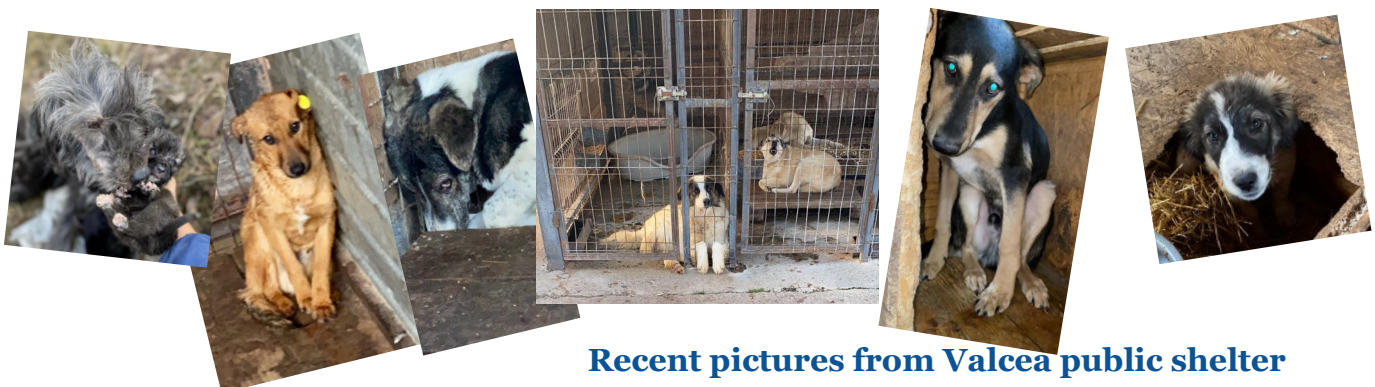
Recent pictures from Valcea public shelter

If this was a person, they would be broken down and seeking help. The dogs on the other hand are expected to know when and where to potty, what they can and can't chew on, to sleep quiet in a new kennel, and to be so excited to meet new friends.