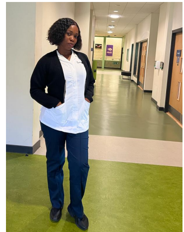
Our proud student nurse