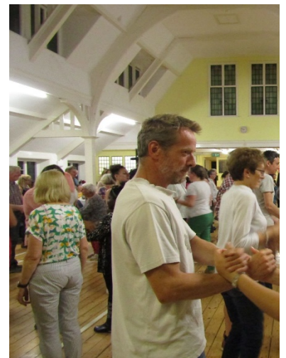
A fundraising Ceilidh