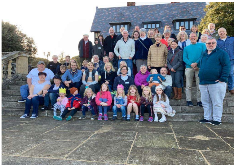
Group in Sizewell, November 2021

relaunching in person worship including Connections in St Johns, 40 Days of Prayer, the Weekend Away at Home (three garden parties in the Rectory garden), our long-delayed Sizewell Weekend Away, the Big Film Event, a Flower Festival in Kelsale, a Harvest Supper, an All Souls Remembrance Event, and so much more.