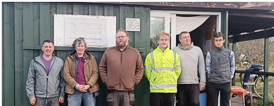
Some of our wonderful volunteers.

https://bhfood.org.uk/no-end-in-sight-as-food-poverty-continues-to-soar-in-brighton-and-hove/