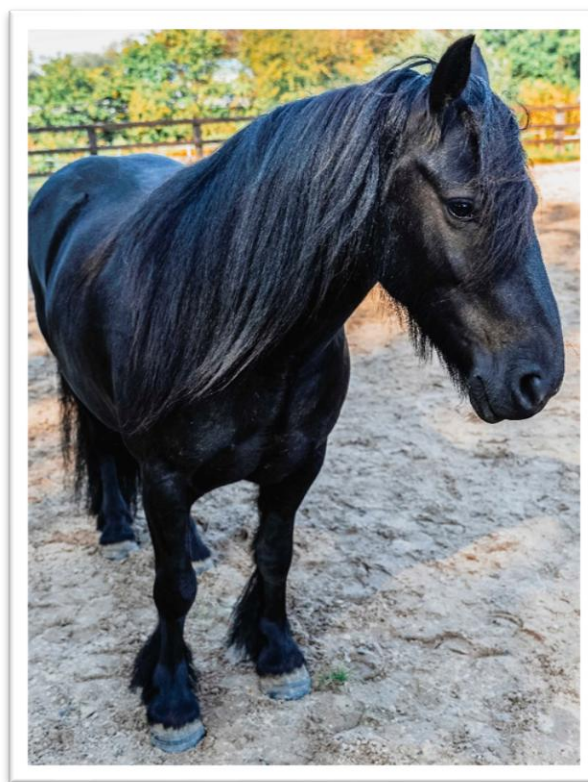
Figure 2: Hector

to welcome him to our team. Hector is forward, yet safe and will be a great pony for those riders wishing to come off the lead rein and ride more independently. He has proved to be popular in lessons and is very comfortable to ride, responding really well to both voice and leg commands.