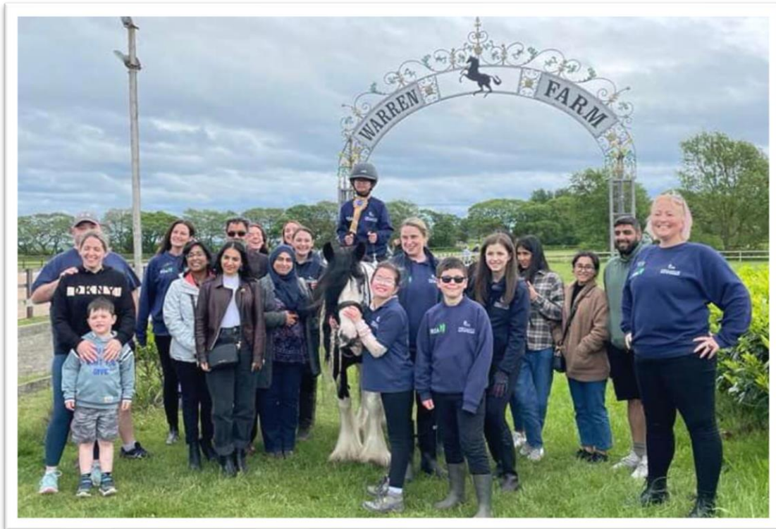
Participants and Volunteers enjoying the Regional Show

We had a really positive summer and remained open throughout the June – August period, which ensured that we were able to provide a consistent routine through the holiday season for our riders and volunteers. Over the summer we enjoyed our regular lessons and took the opportunity to go out for more hacks in the Sunday morning sunshine. We will be registering as an Endurance group so that our hacks actively contribute to our riders' achievements.