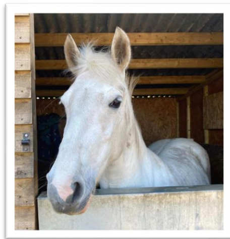
Ruby in our new stable block

The charity used 8 horses during our sessions this year: Seb, Beau, Carlos, Santos, Dougie, Ruby, Lady and Bo Peep. Six of these horses are owned by NCEC and two horses, Dougie and Ruby, are owned by Pegasus RDA. As we move into 2023, our focus still remains on adding a new weight-bearing equine member to our team, alongside Tyson who will start to work in sessions from January 2023.