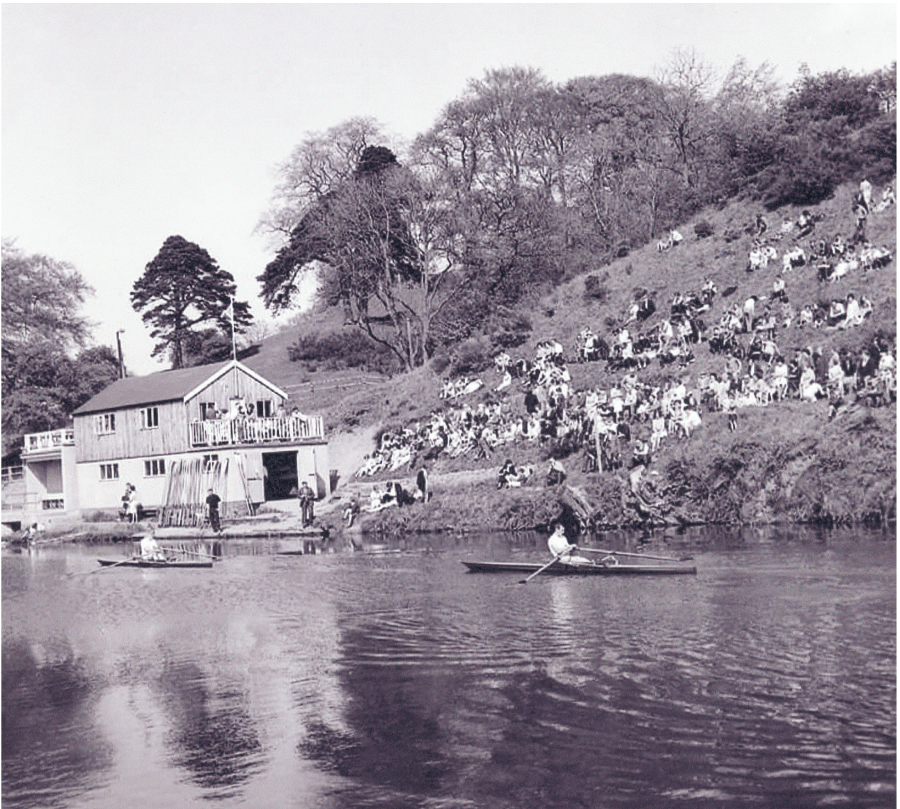
Ebchester Boathouse - 1968

Showing crowds gathered on the Victorian Terraces to watch rowing regatta