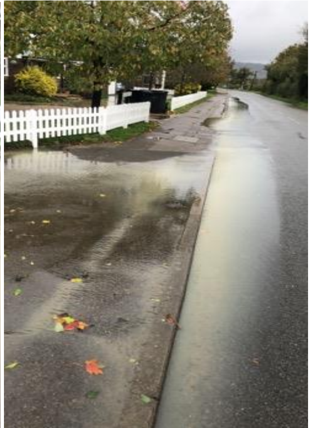
BERT has been reporting the blocked drains at Brockham Row for over five years and requesting action from Surrey County Council