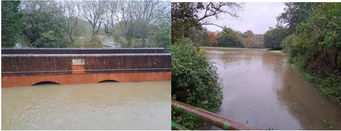
BERT volunteers helped monitor River Mole levels