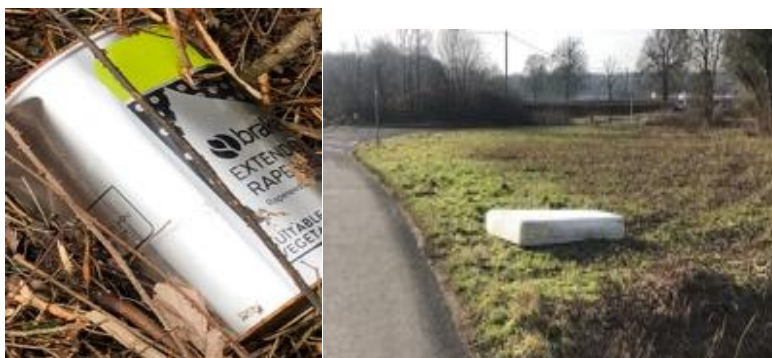
Five litre of vegetable oil drum and double mattress

January 2024: BERT members have been active in reporting fly tipping to the south of the village. These items can obstruct the main drainage ditches. MVDC are excellent in the response to this problem.