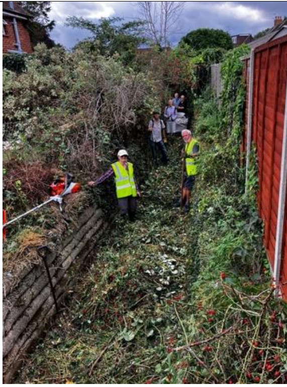
Middle Street to Warrenne Road and on to Middle Street allotments