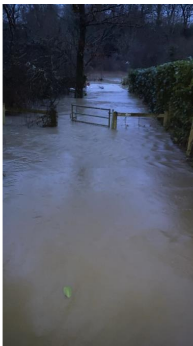
Path to Betchworth not available for the school run! Sunrise 9 February