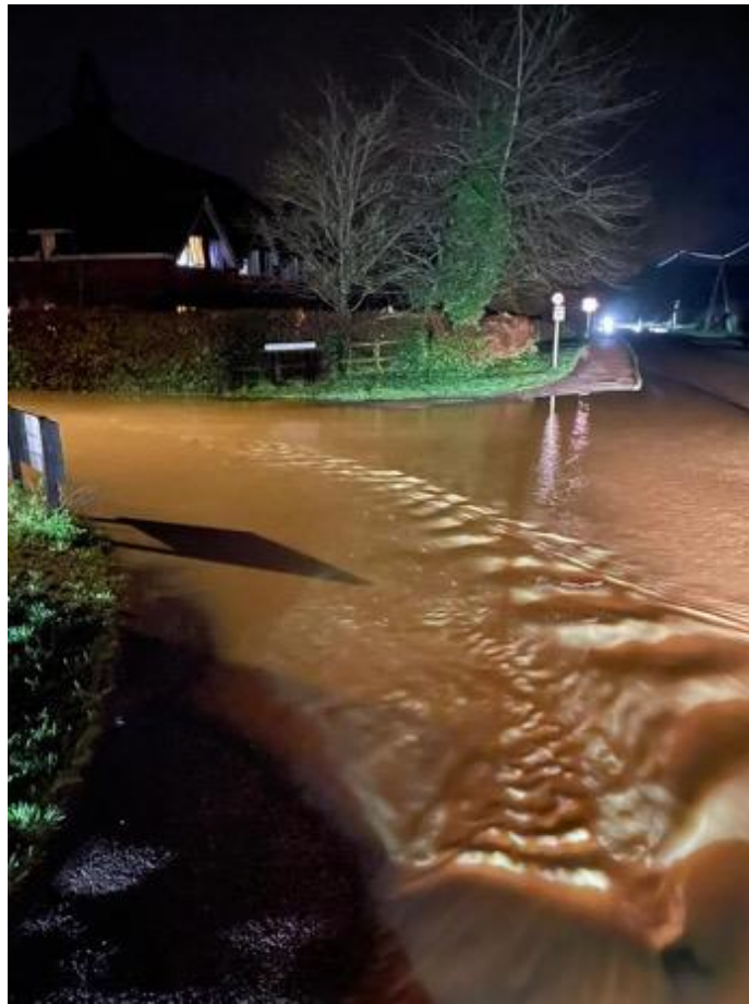
Middle Street/Tanners Meadow

Later in the evening following issues in Middle Street near Brockham Row, the team attended the medical practice in Tanner's Meadow where surface water was flooding onto the car park giving concern for the building. Sandbags were deployed stopping water accessing the car park from where the water gradually reduced.