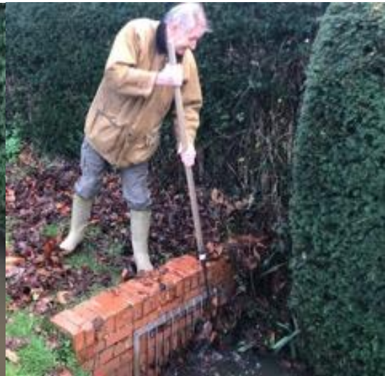
Grill on The Green cleared