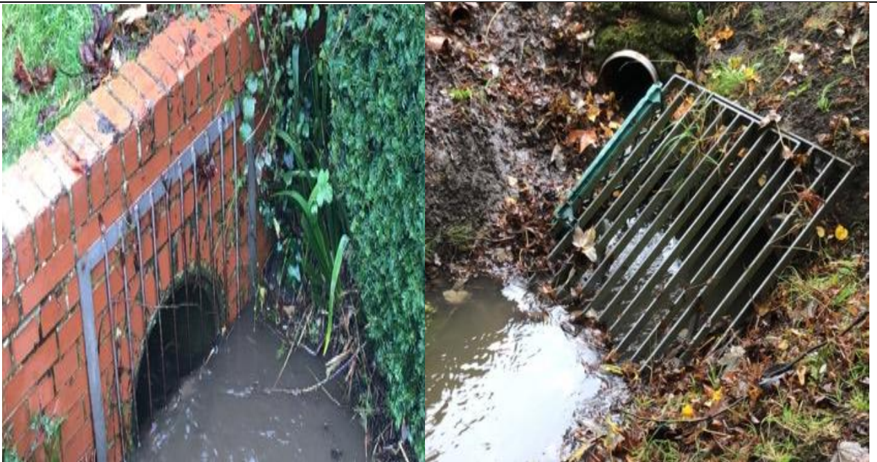
BERT volunteers cleared the grills and culverts at Wheelers Lane.