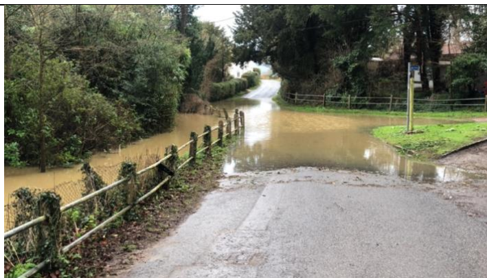
Old School Lane closed to most traffic.