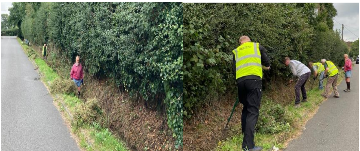
Ditch clearing at Tweed Lane