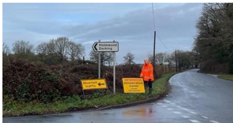
Road sign bridge closed placed by volunteers.