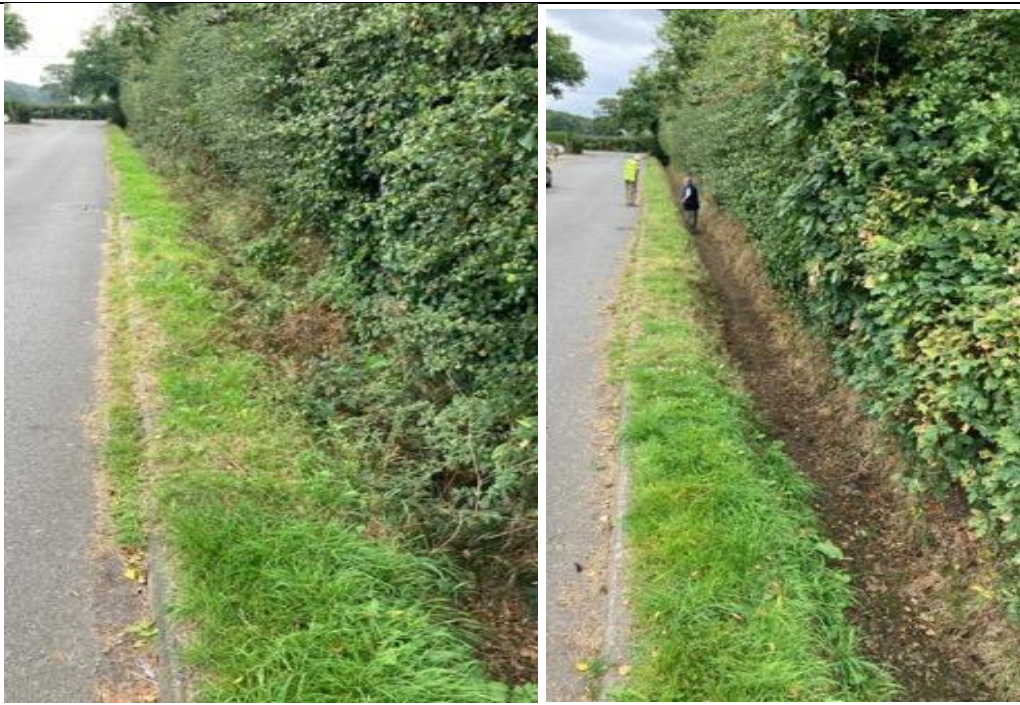
Tweed Lane ditch before and after