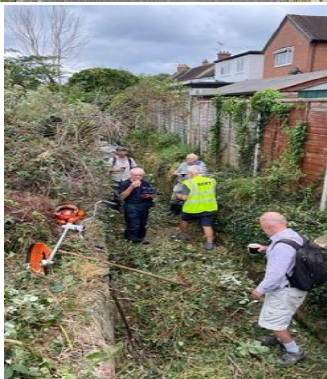
Oakdene Road – pause for refreshments