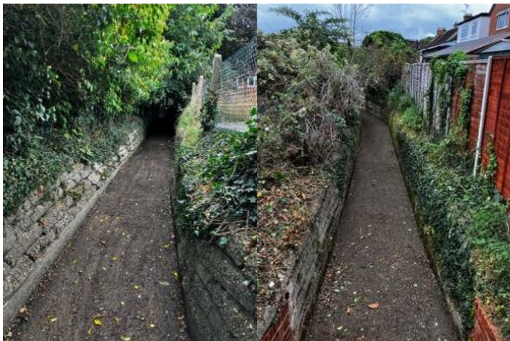
Ditches cleared by volunteers