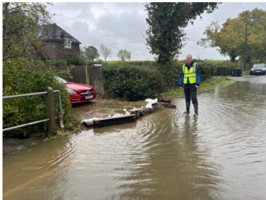
BERT volunteers helped prevent flooding

BERT volunteers were in action on 1 and 2 November deploying sandbags, monitoring river levels and placing flood signs where needed.