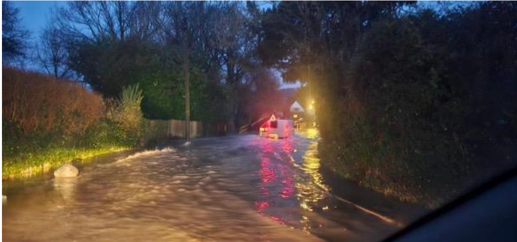
Borough Bridge early morning