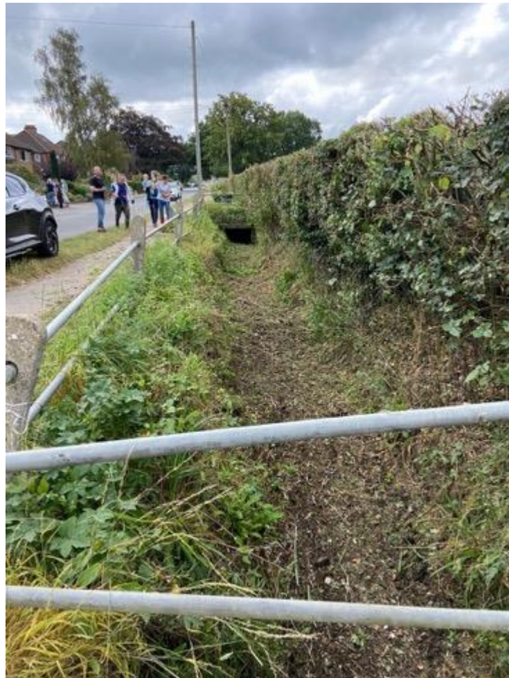
Pavilion Ditch, Middle Street