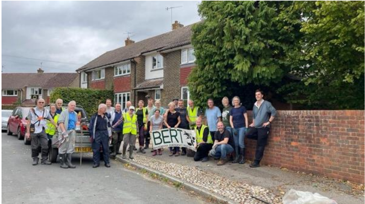
A good turnout!

A HUGE thank you to all the residents who turned up to help BERT with the annual ditch clear on Sunday morning.