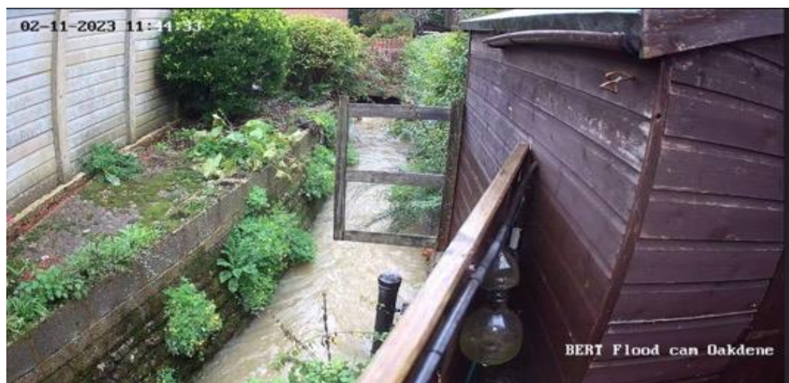
BERT monitoring cameras in action