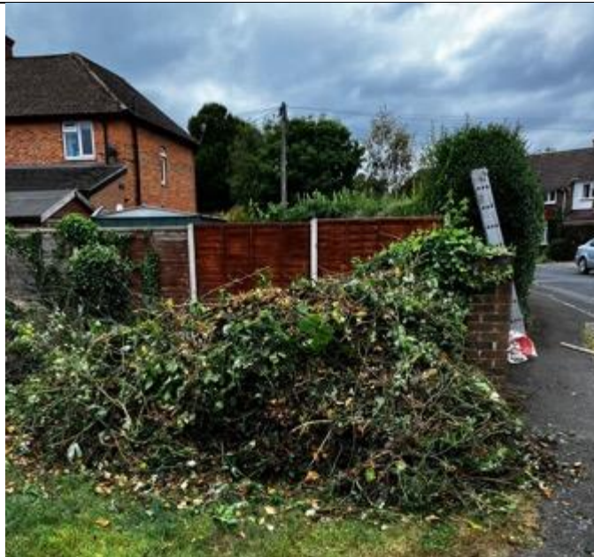
Vegetation cleared at the ditch in Oakdene Road