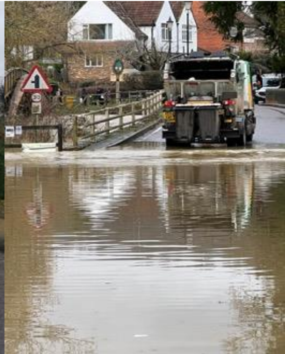
Bin washed away by Borough Bridge spilling contents.