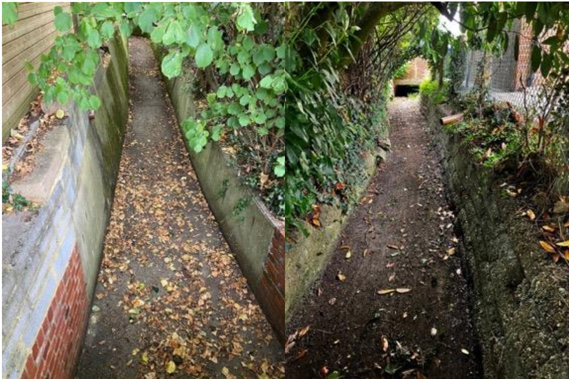
Ditches cleared by volunteers