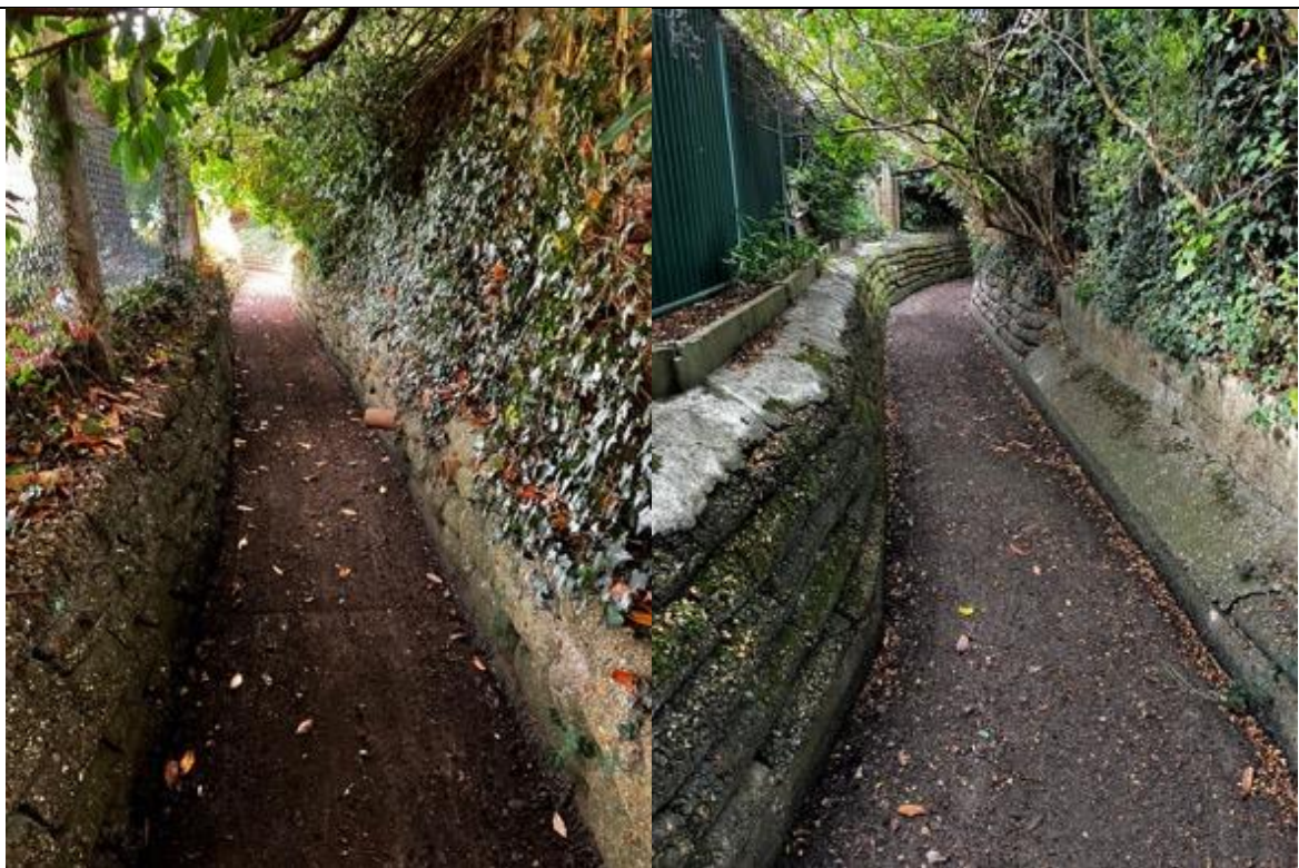
Ditches cleared by volunteers