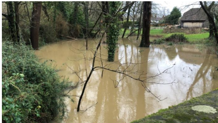
Mole burst its banks but contained – Old School Lane

9 February 2024 7 am : update to residents via Facebook from a trustee: