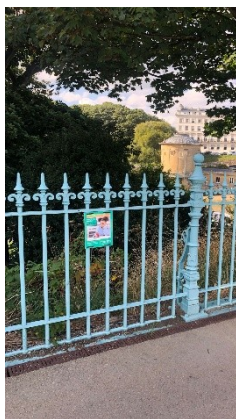
Prevention signs on approach to Spa Bridge.