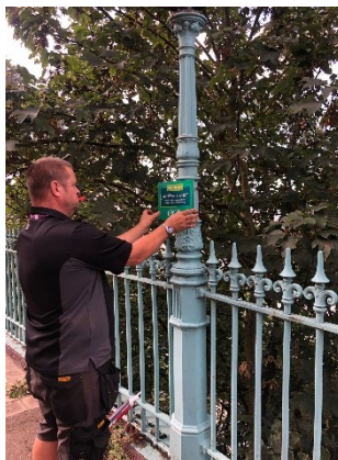
Crisis signs on Spa Bridge.