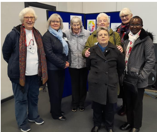
(DMJ at the Coloma Founder's Day mass.)

Two of the Sisters continue to serve as Governors. In order to maintain the ethos and provide spiritual support for both staff and pupils, the DMJ fund a chaplain for the school. The lay chaplain employed, has begun work and has already made a positive contribution. There have already been retreats for most year groups. She has also increased the links with the sisters and the pupils knowledge of the Congregation and its history. A new "Founder's Day" mass was celebrated on 1 st December, organised and attended by year 9. Several of the sisters attended.