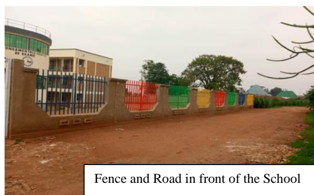
Fence and Road in front of the School

Due to rapidly rising construction costs, the plans for the work were adapted. The fence around the school was built and the road in front re-surfaced. The playground, instead of being laid out as Volleyball and basketball courts was simply levelled and planted with grass.