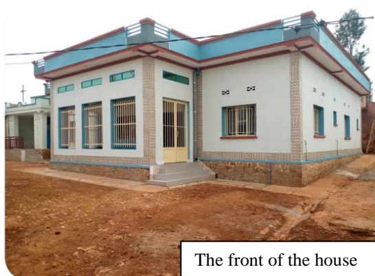
The front of the house

The renovation of the Community House is also now completed. The walls have been plastered, the roof, the ceiling, the tiles have been put in, the walls painted and electricity and water have been connected. A report and accounts have been received by the Trustees.