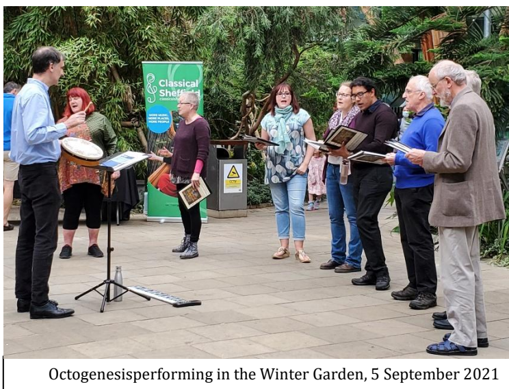
Octogenesis performing in the Winter Garden, 5 September 2021

These will be used to ignite ideas from members as to the music they could perform in the Festival as well as focusing on important aspects of music-making. Females in the music industry have long been overlooked as composers, conductors and performers, so we see our 10th anniversary Weekend as an opportunity to provide a platform for female music-makers past and present.