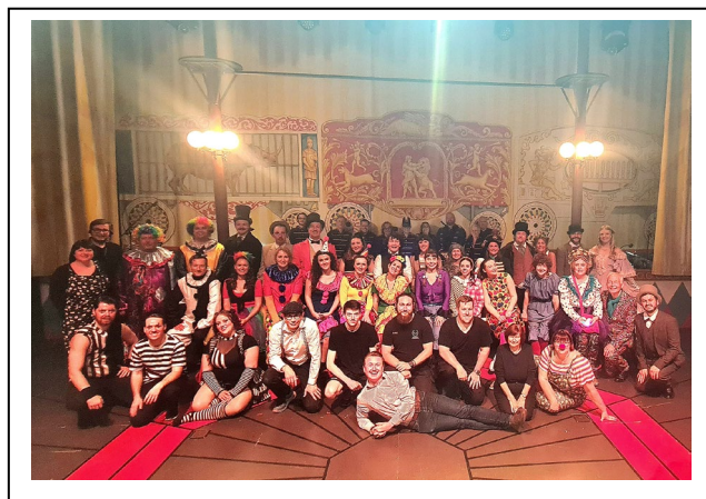
Our wonderful Barnum cast