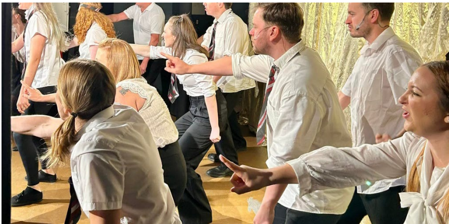
Revolt Children from Matilda

As ever with so many crowd pleasers in the line-up, comments from our faithful audience were positive and they clapped along in all the right places!