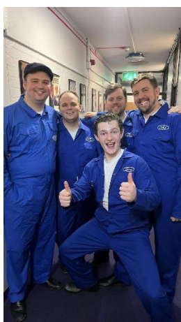
Some of our Ford workers.