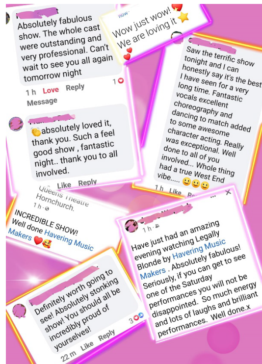
Audience reaction to Legally Blonde via Facebook

Another complimentary NODA Review was received and, as noted above, the reaction from our audiences was truly overwhelming.