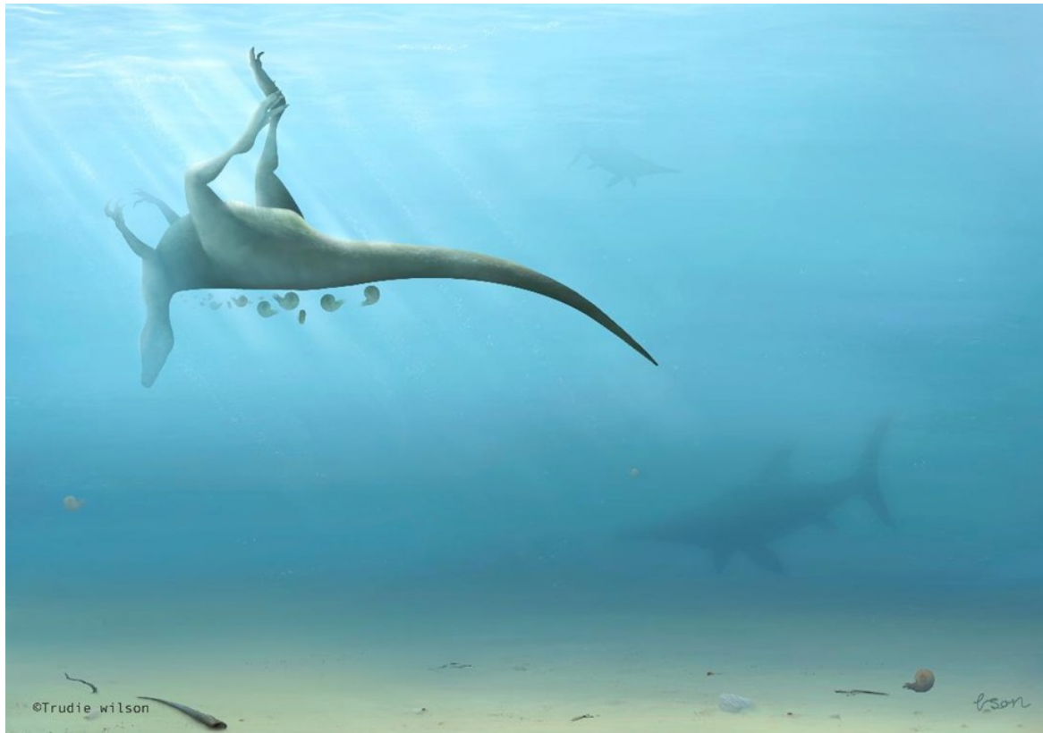
An artist's impression of the body of the new dinosaur Vectaerovenator inopinatus, floating out in an Early Cretaceous sea. © Trudie Wilson.

Vectaerovenator opinatus , a theropod dinosaur new to science was added to the museum's stable of dinosaur holotype specimens. These also include three other theropods, Neovenator salerii , Eotyrannus lengi and Yaverlandia bitholus . Holotypes increase the importance of the collection and enhance its national and international recognition. For a provincial museum this is a good tally.