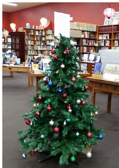
Asia Book room Annual Xmas Tree Fundraiser