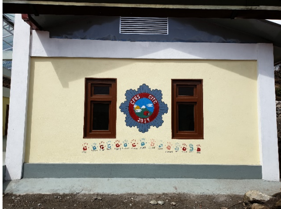
Cheshire Fire and Rescue Service Mural

As with 2021 and the building project at Shree Kanku (6 classroom 2-storey block, WCs, clean water and furniture/furnishings), Shree Janata, Lokhim has been supported by Cheshire Fire and Rescue Service and their Fire Apprentices.