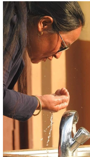
Clean Water Tastes Good!

The practical response from the local community to support the construction was outstanding. Literally hundreds of people got involved including transporting materials and breaking down rock for aggregate. This is a vivid example of the importance and pride local people have in the education of their children.