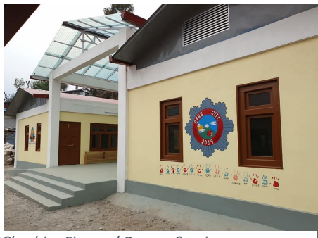
Cheshire Fire and Rescue Service