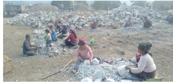
Local Women Crushing Stone for Aggregate

In 4 of the 6 previous projects supported by the fire cadets/apprentices they have travelled out to Nepal to see the outcome of their fundraising efforts. A combination of domestic pressures in the UK and travel issues in Nepal meant that a visit this year was not possible. CITC remains extremely thankful for the efforts of the fire cadets and fire apprentices in making a difference to young people's lives in a far away country.