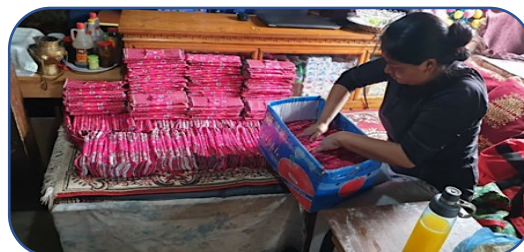
Reusable Menstrual Health Kit being Made by Local Women, trained by CITC Nepal