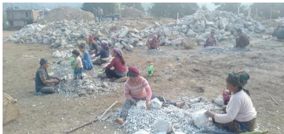
Local People Creating Aggregate from Stone

A project at the village of Lokhim to provide 6 classrooms, an early years play area, toilets, clean water and fully resourced classrooms was begun in 2021. The classroom building will be similar in design to Kanku and occupied by primary years children.