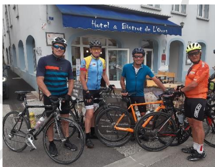
Cycling to The 'Wild Peak'