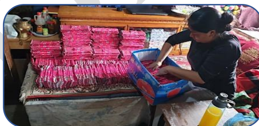
Reusable Menstrual Health Kit being Made by Local Women, trained by CITC Nepal