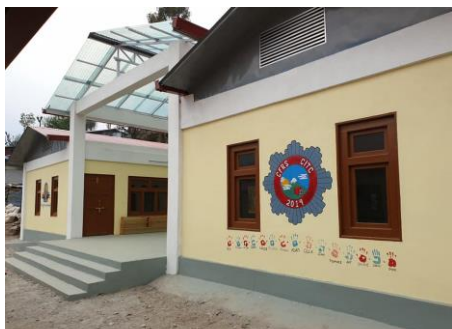
Cheshire Fire and Rescue Service

We raise money in a variety of ways, including: