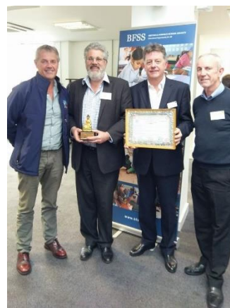
British and Foreign School Society