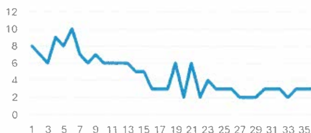
Attendance by Session Number