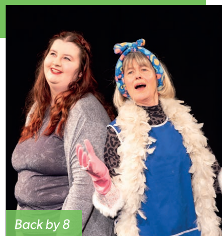
Back by 8