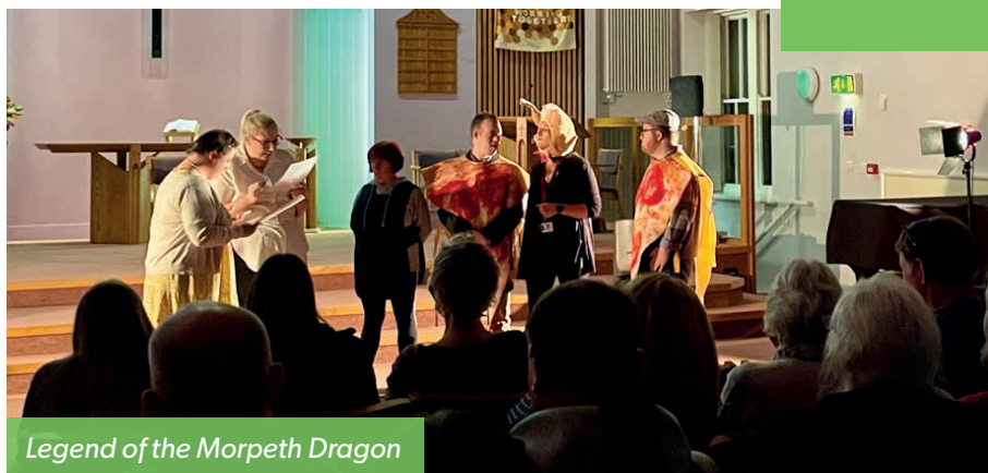
Legend of the Morpeth Dragon