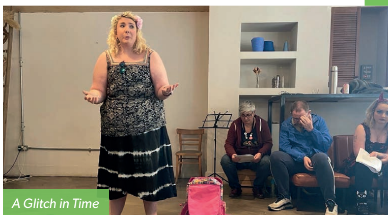
A Glitch in Time

"Emotional, relevant, funny. Issues that are current and relatable"