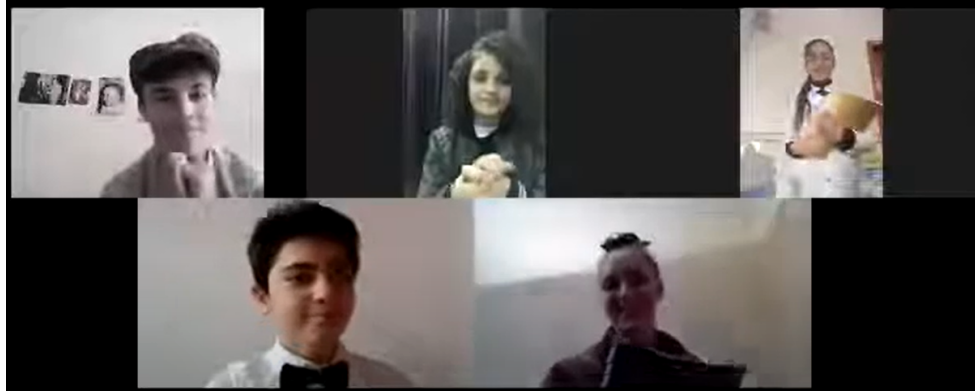
The international cast of Live Your Life