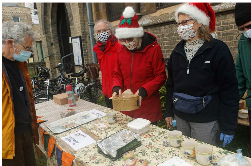
The Winter Fair was our first time real world event since the pandemic began

By December we could meet again and, despite covid restrictions and a rainy start to the morning, we saw a good turnout for our winter fair at St Giles Church. The sun did eventually break through, and visitors enjoyed stalls selling hot drinks, homemade cakes, crafts made by refugees in Greece, Christmas cards and CamCrag ponchos. We also held a raffle for a magnificent hamper, and in total raised £1,256. Thank you to everyone who contributed their time, talents, crafts and cakes.