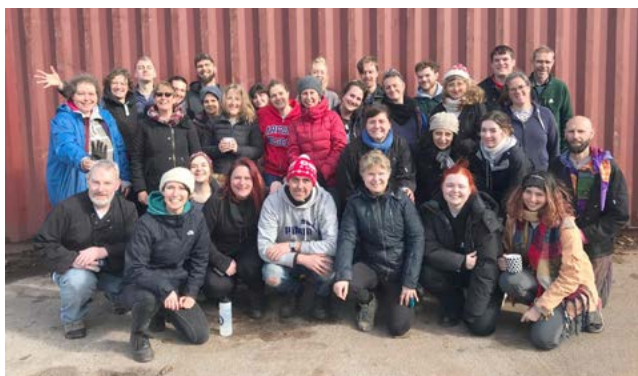
Volunteers on our March 2020 convoy, the last one we were able to hold until September of this year

"We were really impressed by the scale of what's being achieved by a small number of people and limited resources."