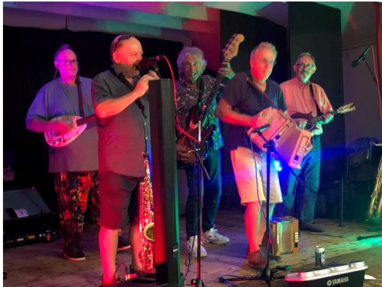
The Ceilidh Band in full swing

This summary is purely indicative. The full inspected accounts are available on request.