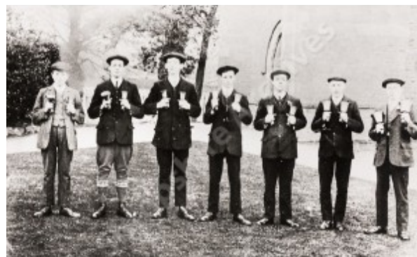
Bell ringers in Meole Brace c 1920

The building was soon erected and an opening concert arranged for Thursday October 20 th 1921 followed by a whist drive and dance on Friday 21 st October. Invitations were sent out to all householders and ex-servicemen who had lived in the area.