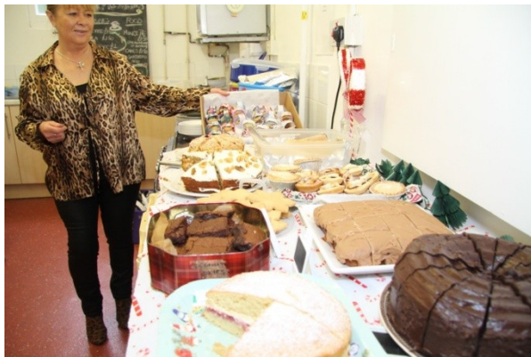
Refreshments for local events

Parties, events depending on time: £35 - £60