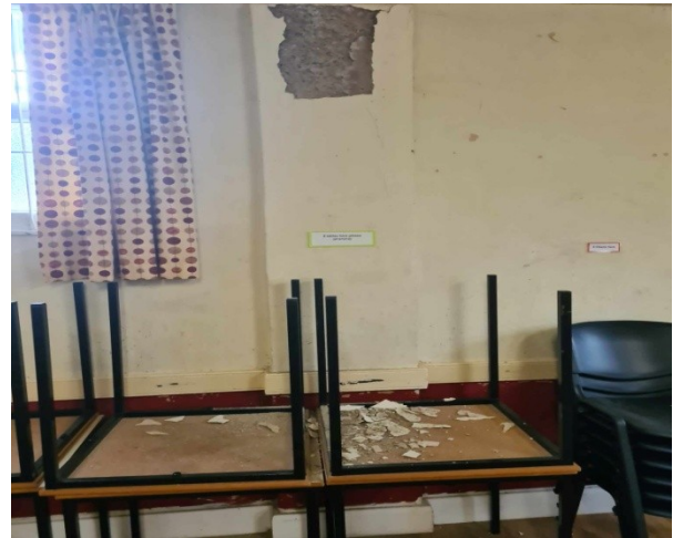
Before the redecoration - a plaster fall

We undertook a significant and much needed programme of redecoration during the quieter summer months. This involved a lot of re-plastering, replacing wood panelling, re-tiling and, of course, up grading the paint work. We were lucky to attract a very competitive quote from a local painter and decorator who was happy to work with volunteers. The outcome has put the Hall in the 'acceptable' category in terms of its overall look.