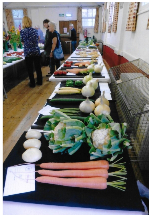
Meole Brace Garden and Allotment Club Annual Show

Meole Village Community Group – monthly meetings free of charge