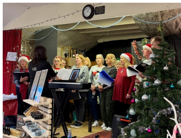
Festive singers at the Frost Fayre