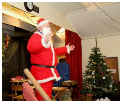
We were thrilled to welcome Father Christmas himself, who kindly opened the Frost Fayre