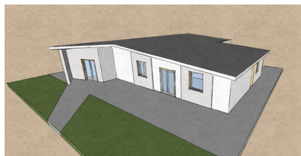
What a potential rebuild using standard components might look like

on standardised, and therefore economical, components to help give the local community an idea of what a future new build Hall might look like.