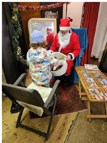
Father Christmas at the Frost Fayre