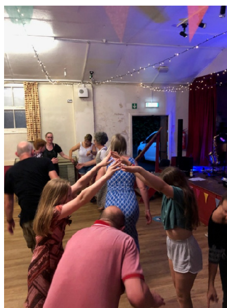
Ceilidh dancing in the Hall

Parties, events depending on time: £35 - £60