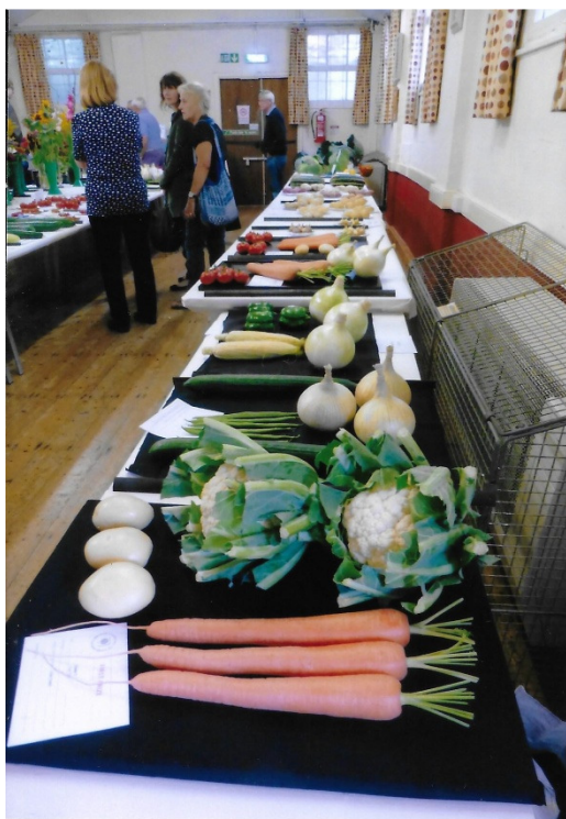
Meole Brace Garden and Allotment Club Annual Show was reinstated in 2023