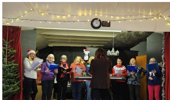
Carol singers at the Frost Fayre