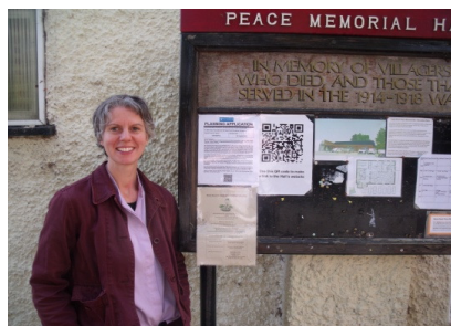
Our Planning Permission notice

The Hall has complied with the legal requirement to have annual (electrical) Portable Appliance Tests and a commercial Gas Installation Examination. The Gas Examination revealed faults with two of our three gas heaters. These were repaired at some cost and were ready by September when the weather started to get colder. In addition the fire extinguisher inspection by Oakleys took place in July.