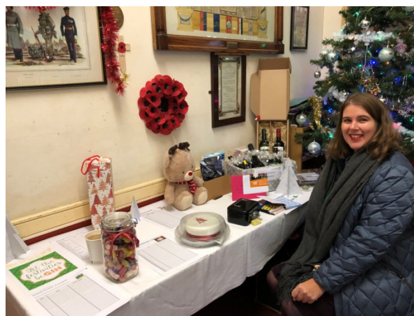
Frost Fayre stall holder