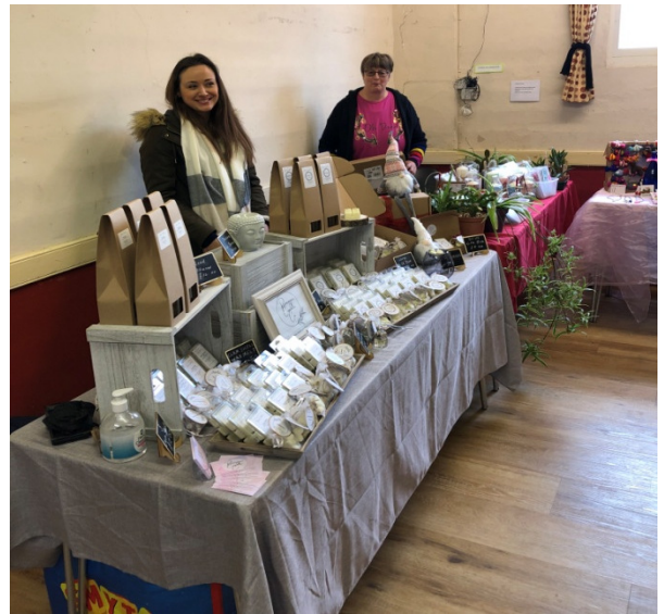
Frost Fayre stall holder