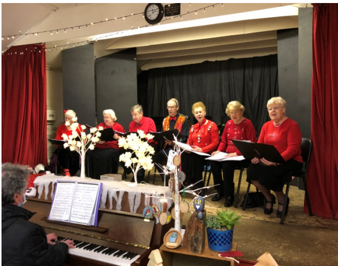
Shropshire Musical Singers Farewell Concert