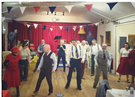
1940s Dance Night Demonstration