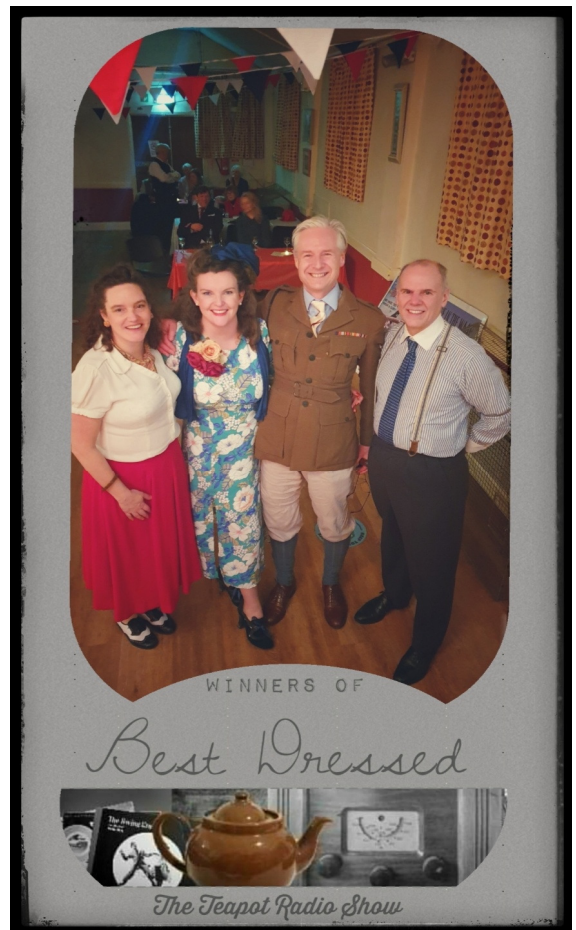
1940s Best dressed competition