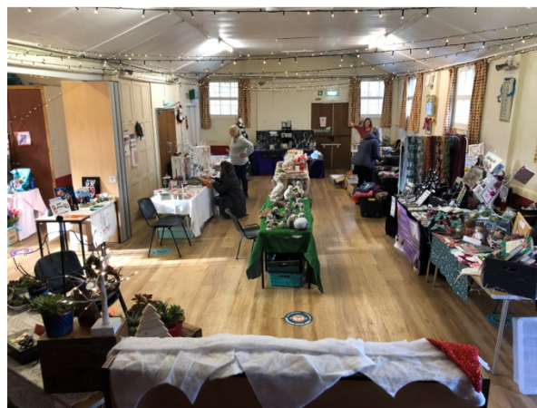
Hall decked out for the Frost Fayre