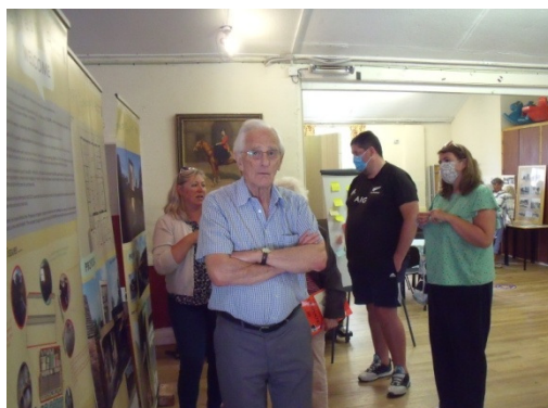
Consultation event Sept 2021