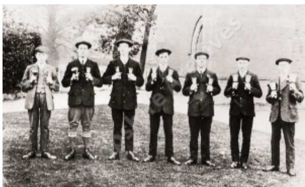
Bell ringers in Meole Brace c 1920

The committee agreed to purchase a hall built of concrete from a Mr Edwards at a cost of £650. It would contain a room 60ft x 20ft wide, a 20ft x 20ft square club room adjoining, a kitchen equipped with a boiler, and ladies' and gentlemen's cloakrooms with lavatory accommodation.