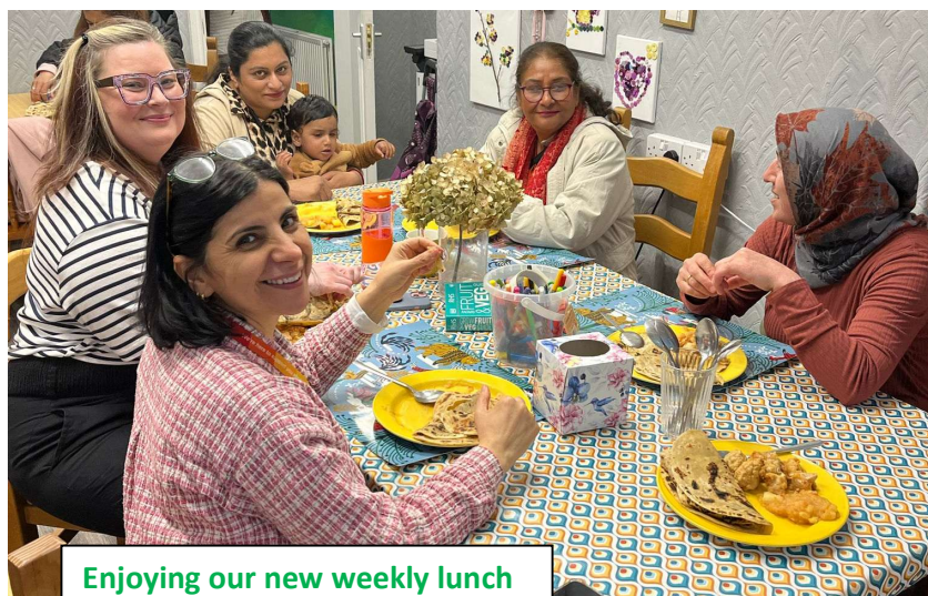
Enjoying our new weekly lunch offering cooked by hub members