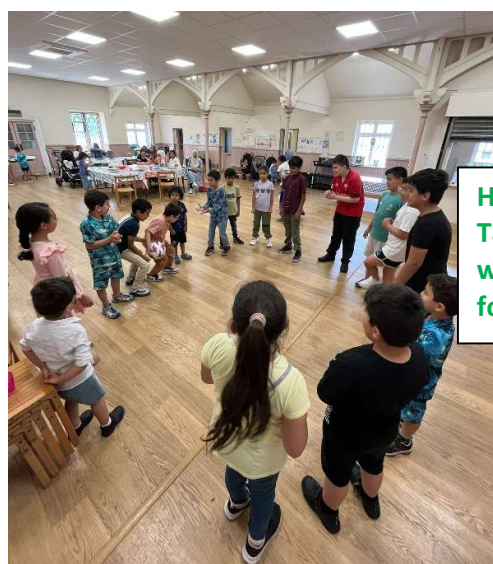
Holiday activities and a 'Staff Takeover' Christmas Dinner when all UareUK staff cooked for everyone!