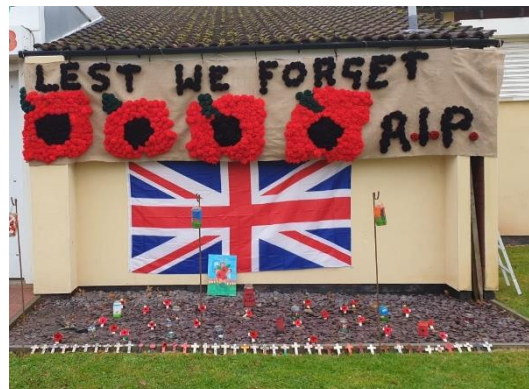
Local people were given wool to make red and black poms poms which was the turned into giant poppies to display for Remembrance Sunday. The service was streamed online and people could watch in the street.

Life after the Foodbank: Just prior to the start of this year BHCAG secured funds for a project called 'Life after the Foodbank'. This initiative is being delivered in partnership with the Big Local Venture Centre and enabling us to support local people and families who are suffering financially. The project aims to provide a 6 week programme of support whereby people in financial difficulties attend and participate in weekly healthy, budget cooking sessions. Alongside this they also receive advice and guidance to tackle the root cause of their financial issues from partner organisations including Wolverhampton City Credit Union, local housing providers, family budget sessions, mental health awareness, into work support and confidence building. Each week the person takes home the ingredients to provide them with a weeks' worth of meals and returns the following week, with