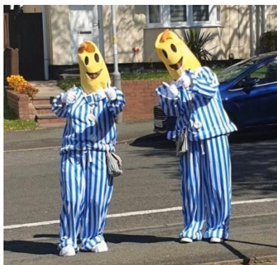
BHCAG members dressing up for street walks to cheer up our community during lockdown