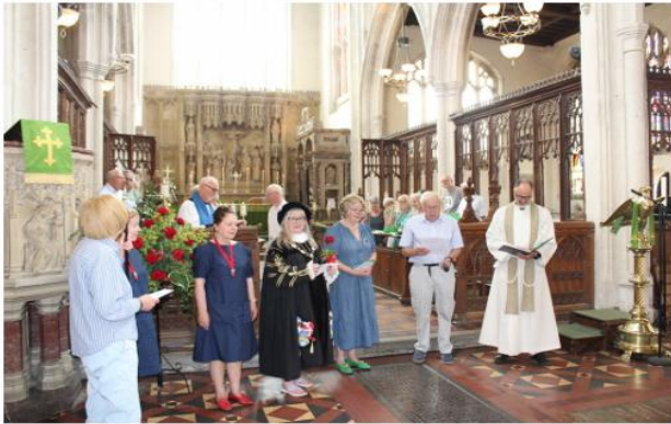
2025 Rose Ceremony