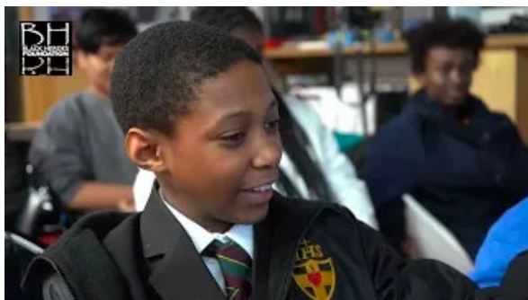
Overview of Black Heroes and Our Wandsworth Youth Workshop