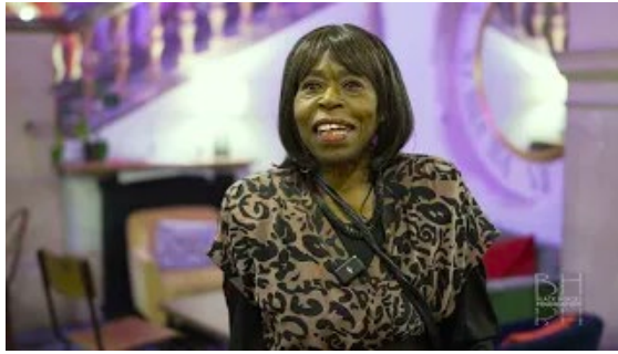
Black Heroes Soul Food Cafe, Battersea Arts Centre - What they said: