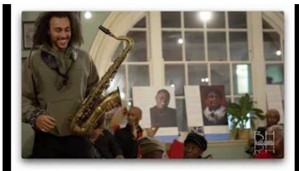
Black Heroes Soul Food Cafe, Battersea Arts Centre: