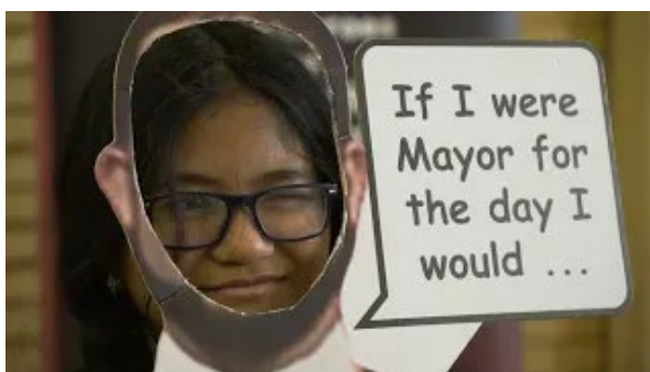
John Archer – Children as Mayor for a Day: Part of WAF 23 Going Places:

The children's work was displayed on 17 June, at the award-winning Black Heroes Soul Food Café. The Story of John Archer exhibition was displayed, together with a reading from The Story of John Archer.