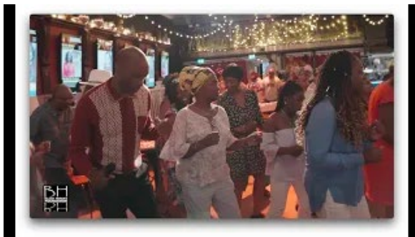
Black Heroes Soul Food Café at Wonderville, Haymarket, Piccadilly