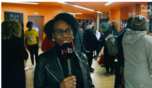
BHM 22: The Story of Claudia Jones - What the audience had to say: