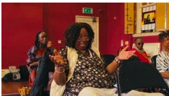
The Story of John Archer - Overview of a Reading and exhibition. Part of WAF23