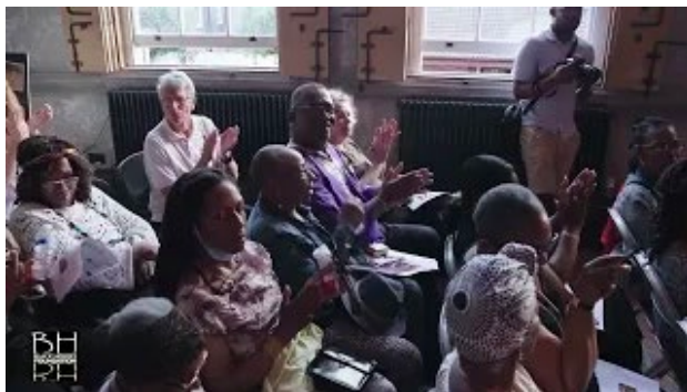
The Story of Flip Fraser - Overview of a Reading and exhibition. Part of WAF23 https://youtu.be/H1b304OzB3c

A Jamaican boy fights the struggles of the Windrush era, and with his lifelong mission, gives a Voice to Black Youth launching the Voice newspaper at the 1982 Notting Hill Carnival, and taking his iconic musical show 'Black Heroes in Hall of Fame – 5,000 years of Black History in one night of theatre' around the UK, the United States and to the Caribbean.