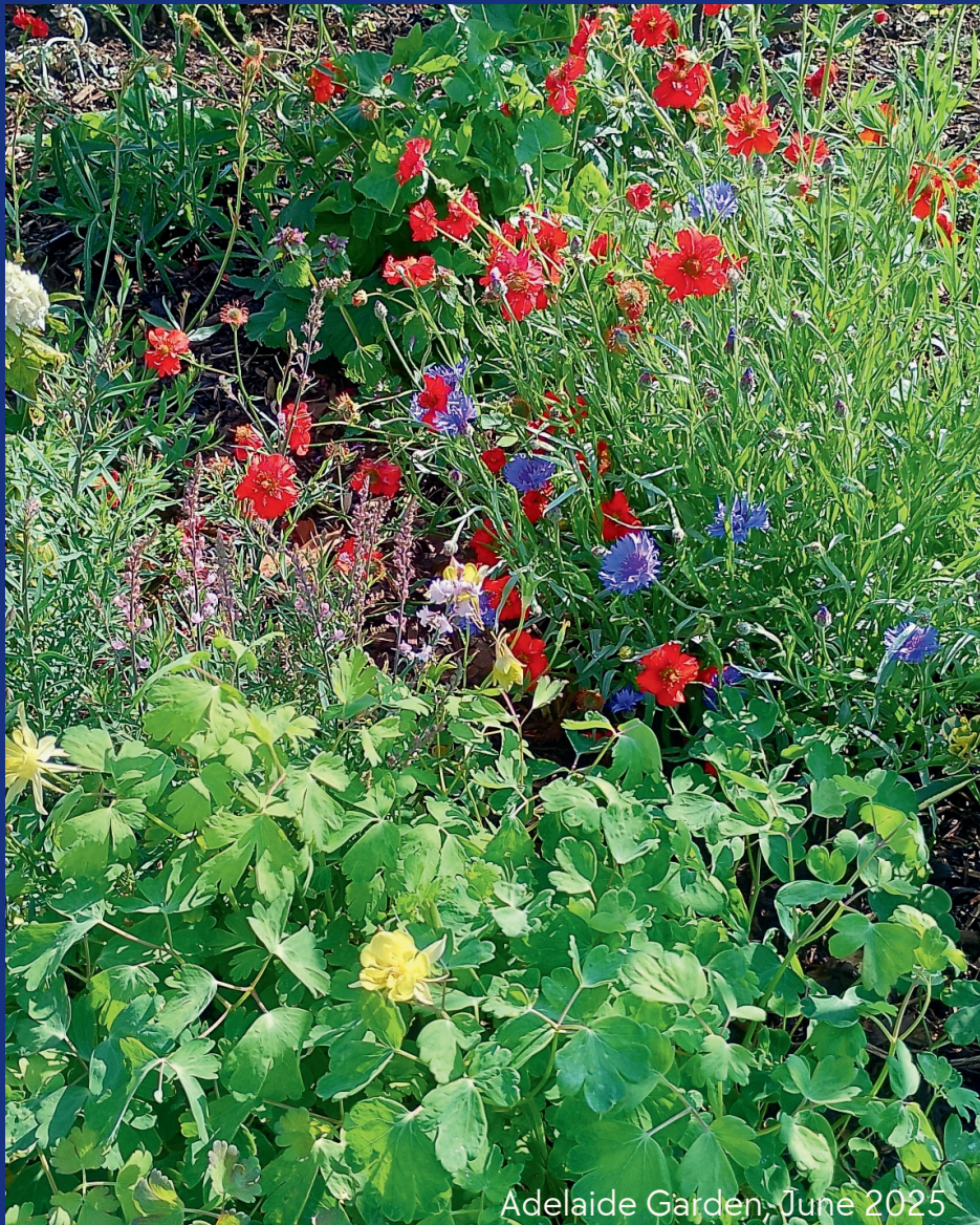
Adelaide Garden, June 2025