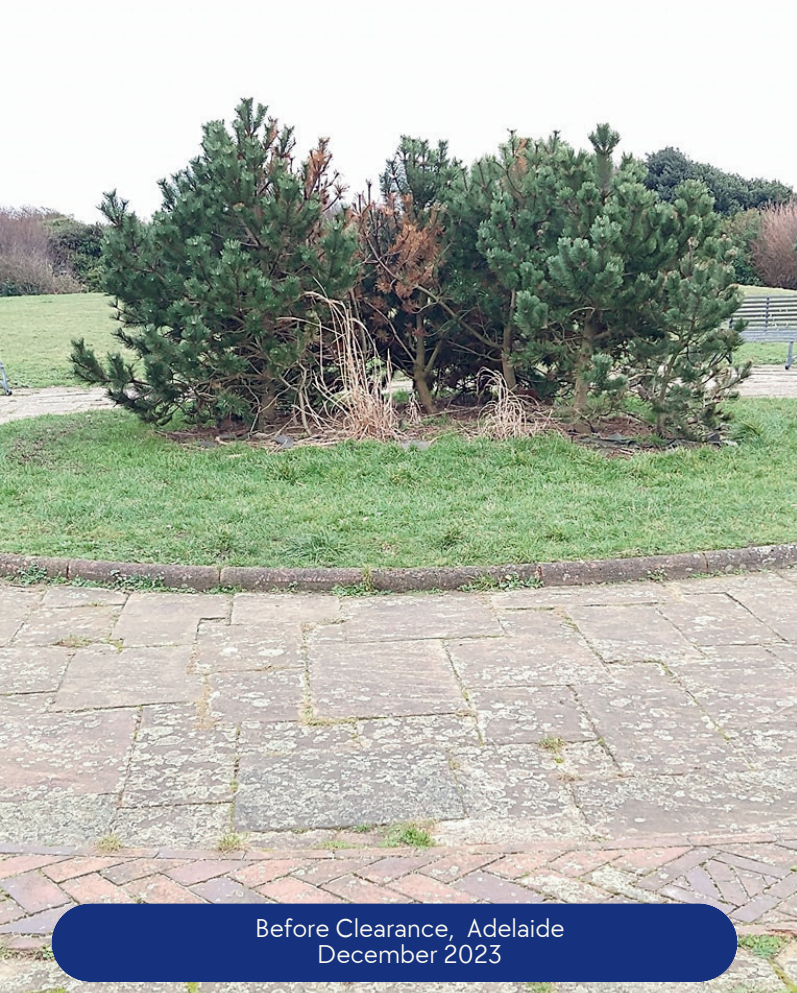
Before Clearance, Adelaide December 2023

Adelaide is one of our most elegant Gardens with a pleasing symmetry to it.