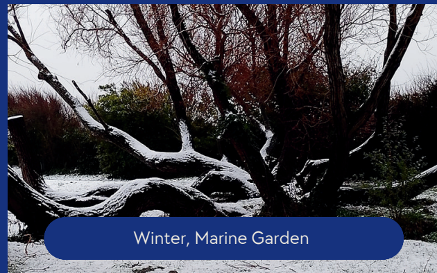
Winter, Marine Garden