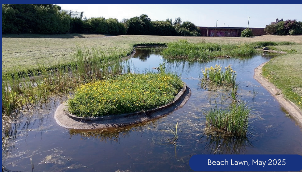
Beach Lawn, May 2025

We have also worked on the ravine and rockery area to uncover stone ornamental areas along the path.