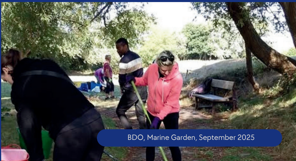
BDO, Marine Garden, September 2025

This year we have continued to maintain the honeycomb paving at the base of the rockery. We had a fantastic team from BDO who worked on this area and made a great difference.