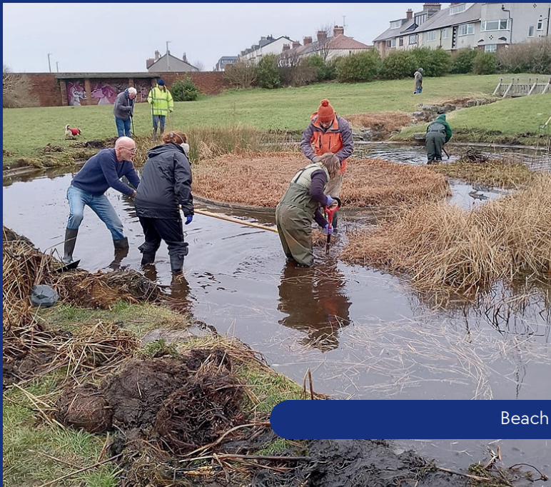
Beach Lawn, Winter 2025