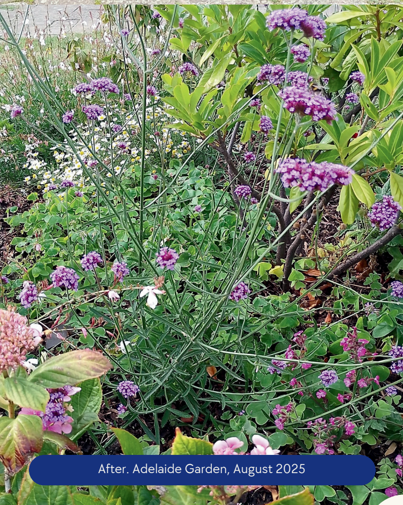
After, Adelaide Garden, August 2025