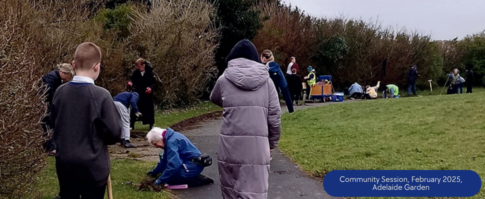
Community Session, February 2025, Adelaide Garden