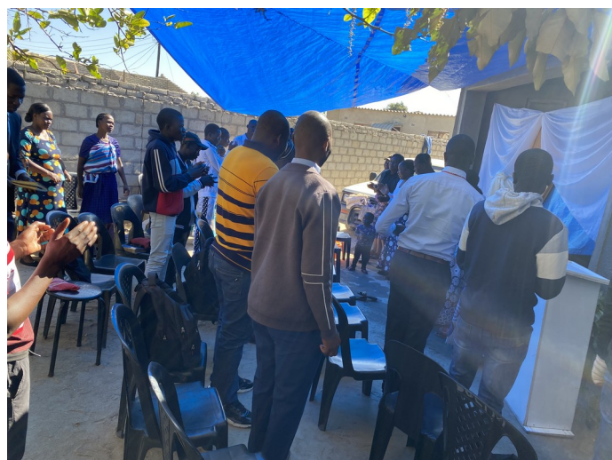
City Church- Harare 28 th May,