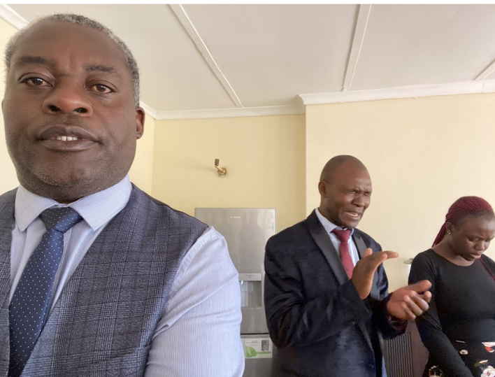
House Church in Gweru - 18 th May 2023 25 th June, 2023