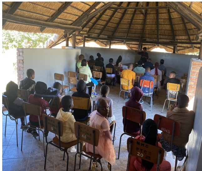
Urban Church- Masvingo

Advancing the Christian faith in the 2023-2024 reporting year was more pronounced in Zimbabwe than in the UK. Relationships fostered by our Chair of Trustees and UK church leaders resulted in requests to visit their mission outposts to carry out evaluation and monitoring exercises while ministering the gospel to the communities. Relationships of trust and respect have been established with the respective organisations.