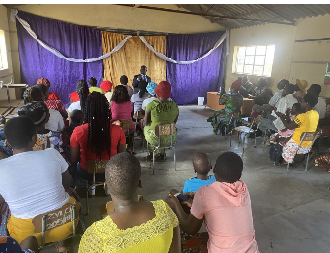
Rural Church near Kwekwe 15 th May, 2023

Advancing the Christian Faith - Sundays 15 May - 25 June 2023.