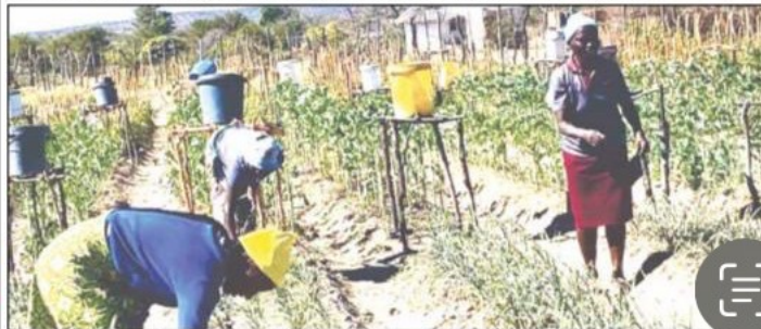
Ekhukhanyeni community gardening project into a commercial farm at Mkombo Village in Lower Gweru

"We also need our government to assist us with inputs as well as farming materials such as wheelbarrows, hoes, shovels and buckets so that we improve our farming techniques and provide larger harvests," said the village head.