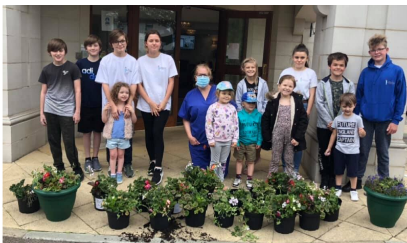
The Youth Team enjoying a day out to help gardening at a local care home in Essex.

In response to the pandemic, our Youth Team have focused on creating projects that bring people together and combat loneliness. To achieve this, the Youth Team set up a pen pal project to connect with elderly residents at local care homes, and help those shielding and most vulnerable to COVID-19 to maintain their gardens.