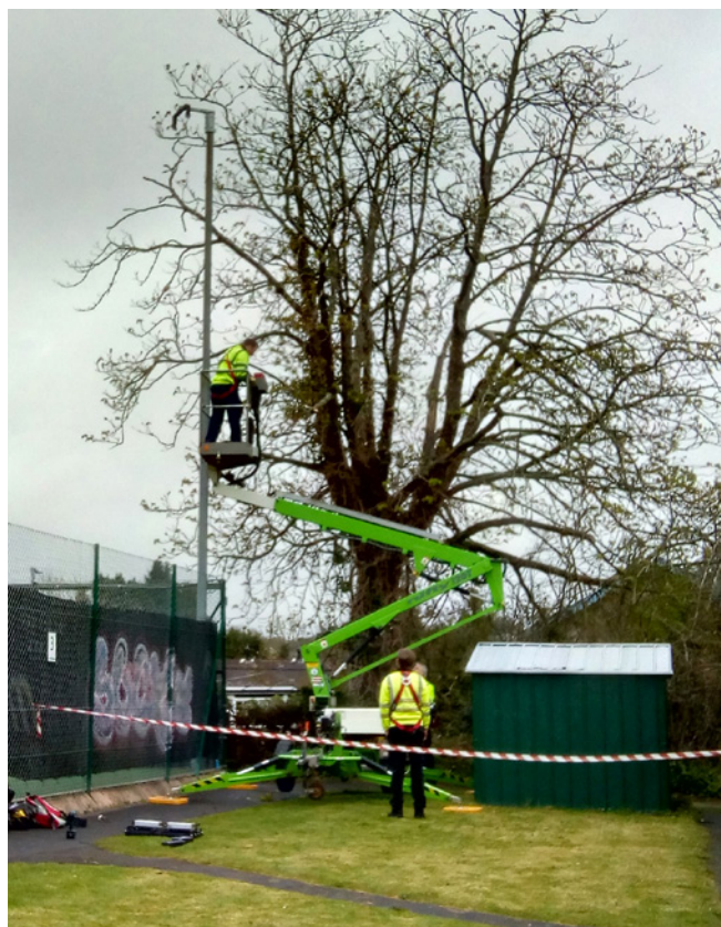
South Hams District Council repairing LED floodlight

The Tweener lights have been repaired and we have come up with a solution to prevent players on the other courts being dazzled. The low tech solution of strategically placed banners works well and looks good too!!