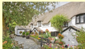
The Cott Inn