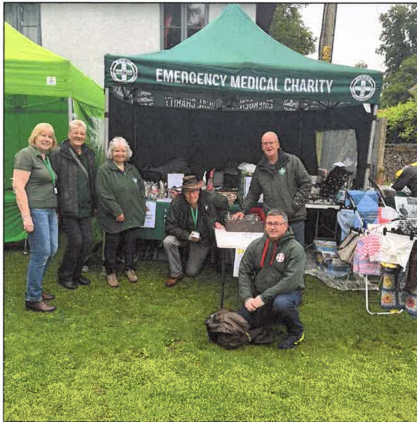
Figure 4: Charity volunteers play a vital role in helping raise funds for SARS