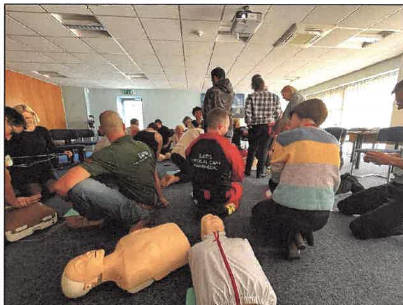
Figure 5: 1318 adults and children attended SARS CPR & Defibrillator awareness sessions in 2023/24