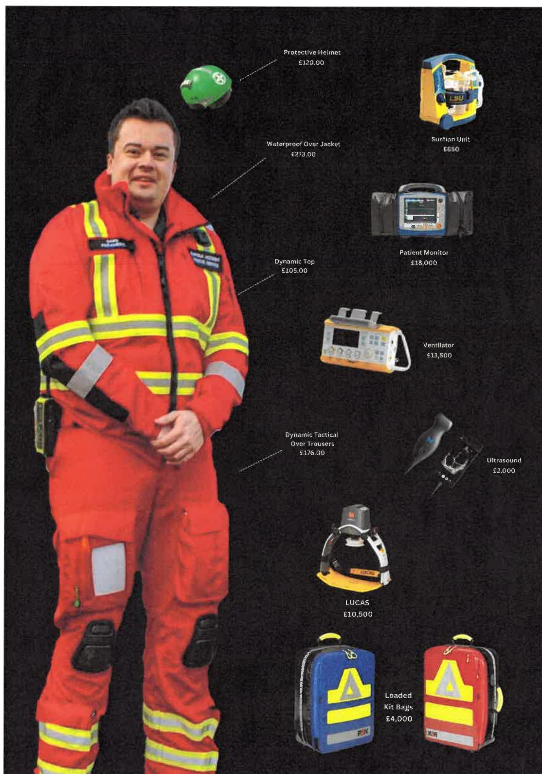
Figure 2: Equipment costs associated with equipping SARS Solo- and Team Clinicians