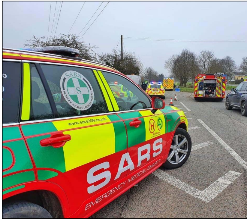
A SARS team in attendance at a serious road traffic collision in 2021

SARS treated 260 patients this year utilising the advanced skills of its volunteers, including clinicians specialising in the field of emergency medicine. Enhanced prehospital treatment of patients included: advanced airway management, defibrillation, cardioversion, temporary electrical pacing of the heart, tracheal intubation, sedation, ultrasound scanning, insertion of arterial lines and anaesthesia.