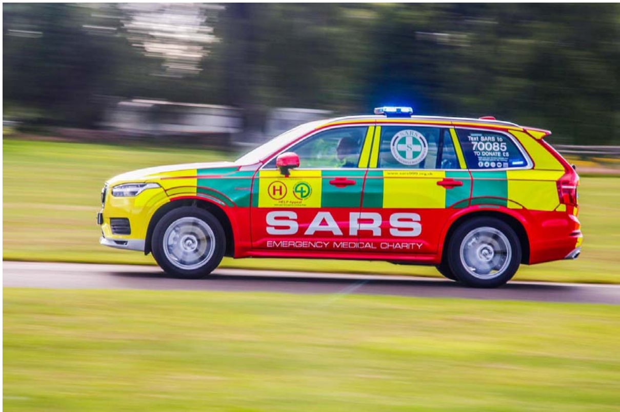
SARS Rapid-Response Vehicle (RRV) SMED26.