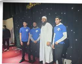
Volunteer at Events