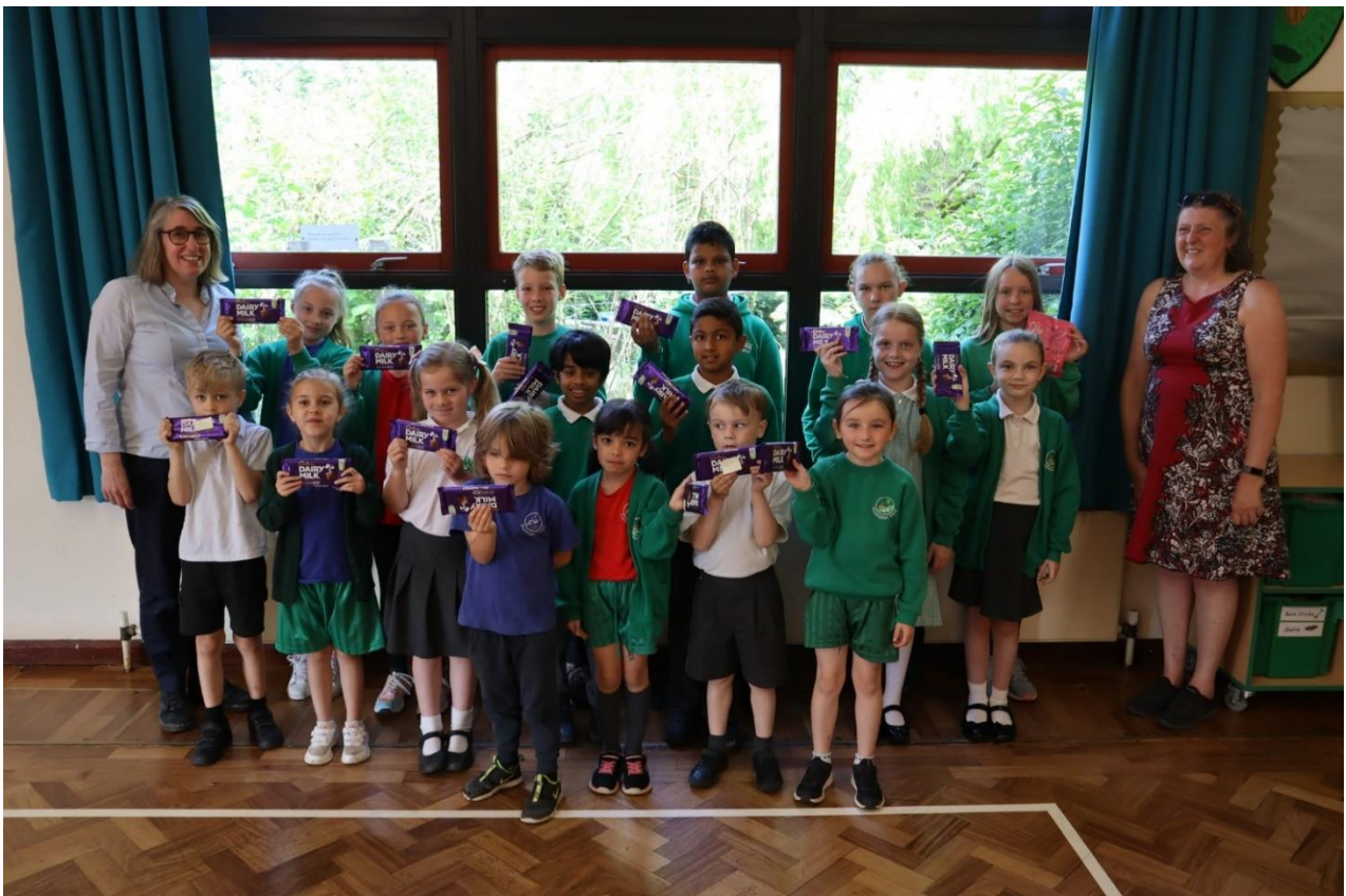
Delighted children at Sheddingdean School receiving their Easter Egg Hunt prizes.

We must pay the most careful attention, therefore, to what we have heard, so that we do not drift away.