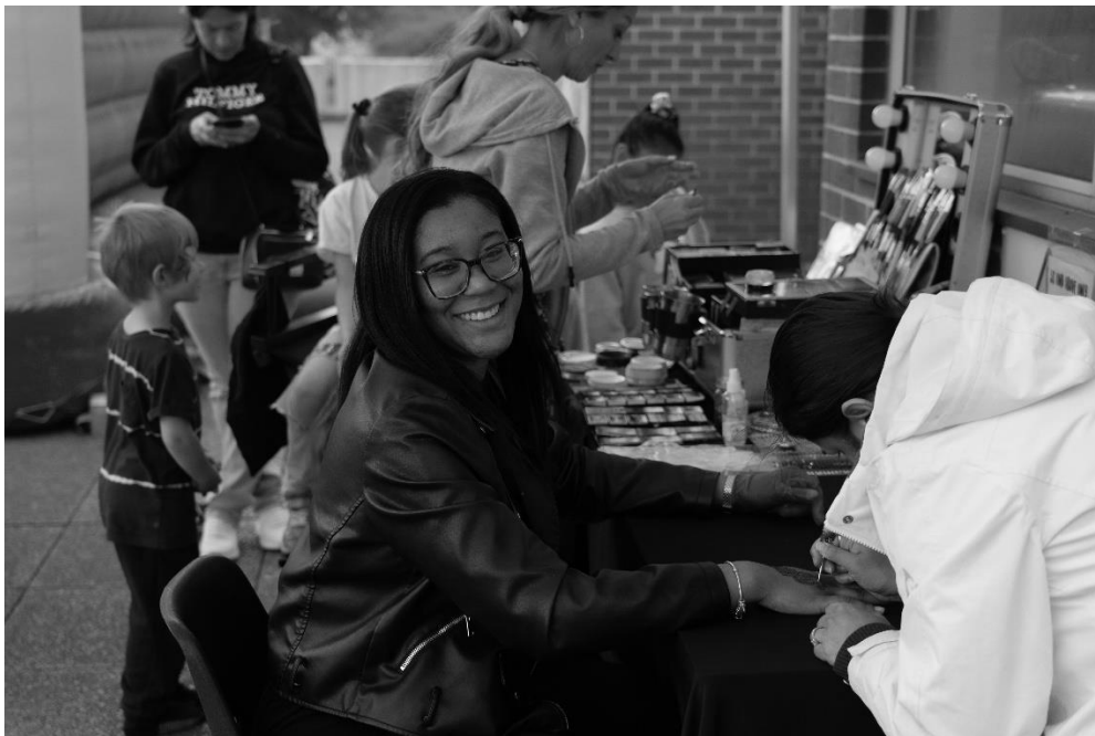
Face painter/henna stand

In December 2024, we hosted a Winter Wonderland party for children aged up to 12 years on the Orchard estate and local families. The party was delivered by an external entertainer (DNA Kids). The Church organised a T-cup ride and Santas Grotto for under 11s. Food and refreshments / tea and coffee were provided by the Church on the day and a gift was presented by Santa to each of the families in attendance in the Santas Grotto. A raffle was also organised. People of all ages were invited and it was free entry. The event had a great atmosphere and a marvellous turnout.