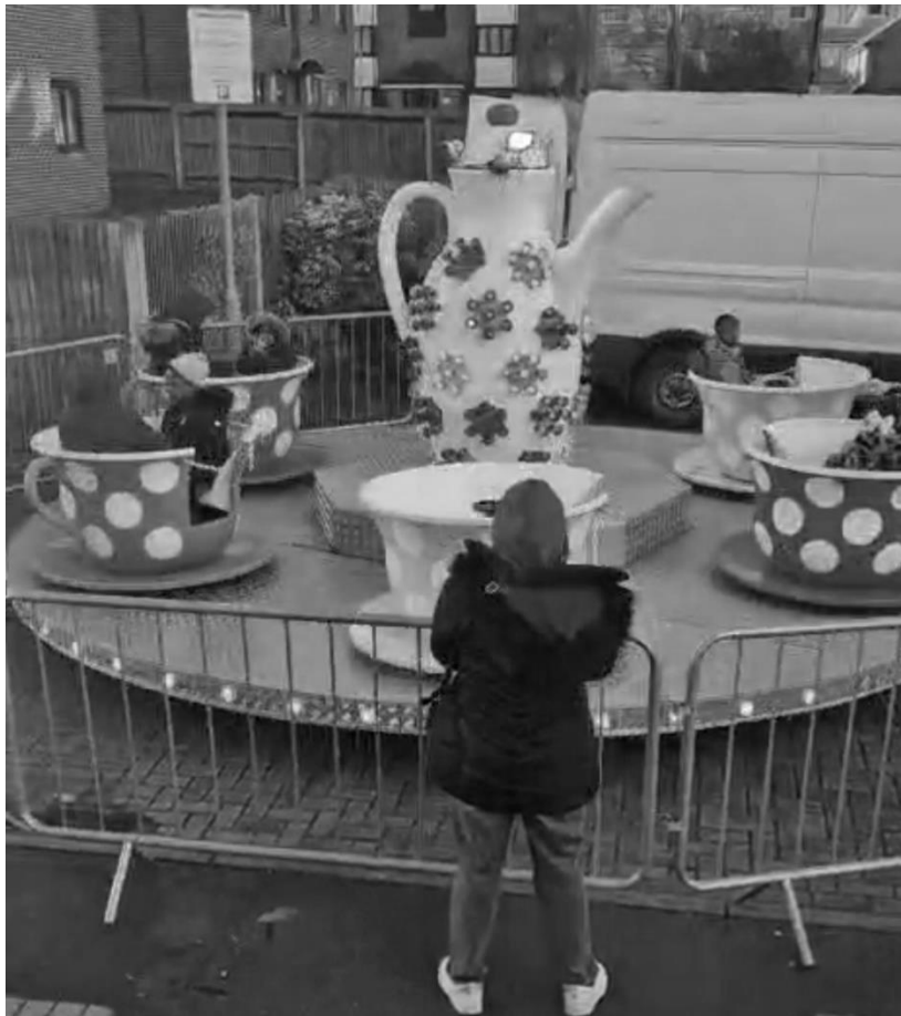
Christmas community event – T cup ride