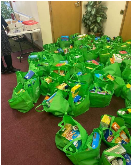
Preparing Goodie Bags - Dec 2021

Financial statements are attached to this report which will show total income for the year and total expenditure for the year, as well as net assets.