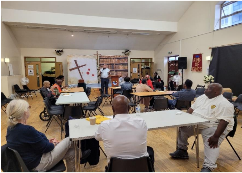
Community Breakfast - September 2021