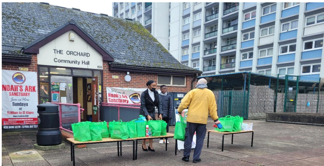
Christmas Goodie Bags – December 2021