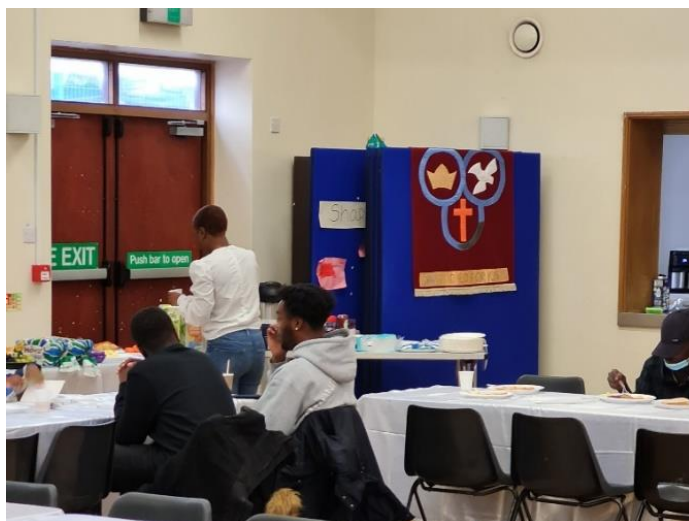
Community Breakfast - February 2022