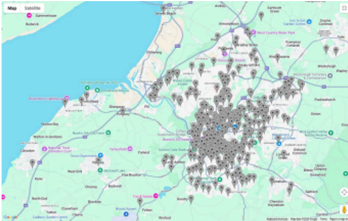
Geographical spread of Changes Bristol group attendees.

We are pleased to report an increase in GP referrals to our services. Our members represent communities from all areas of Bristol, highlighting the reach and inclusivity of our service.