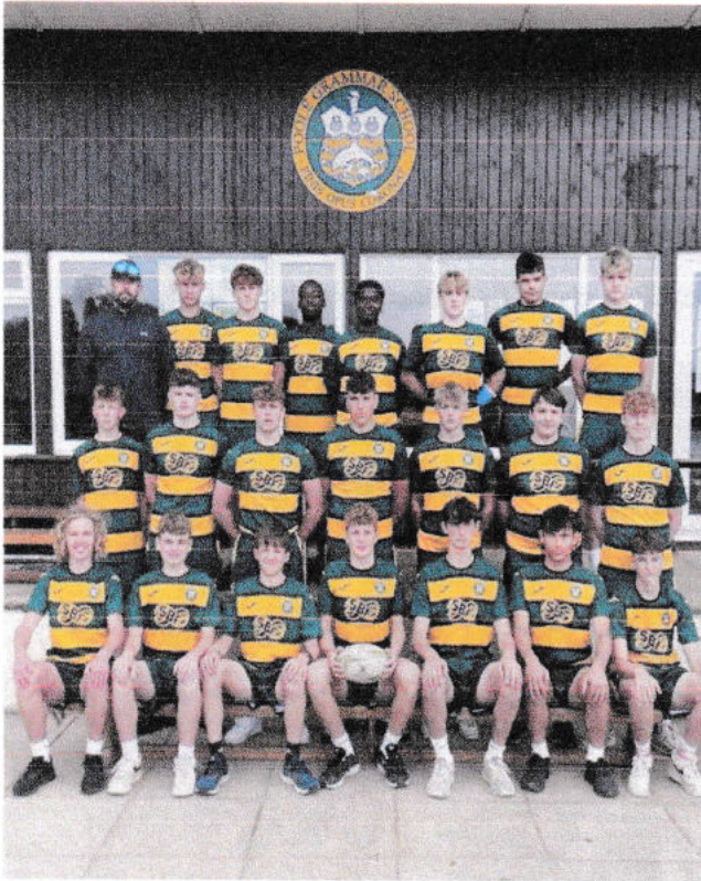
Poole Grammar School - Rugby Kit

Some pictures of the people and group's we have supported are below: