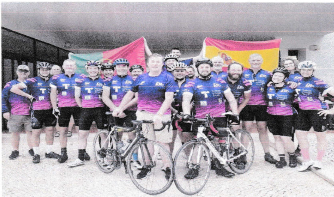
“It’s Too Faro” Cycling Team

Pictures of some of the events, including our cycling challenge team, are shown below: