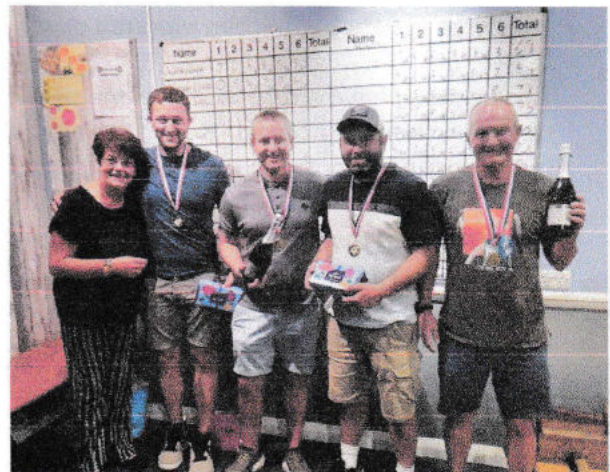
"The Villains and Spoons" Skittles Champs

During the year ended 29 th February 2024, the company generated funds amounting in total to £140,788 (2023 - £44,432). The increase in this income has been more fully detailed above under the Fundraising heading.