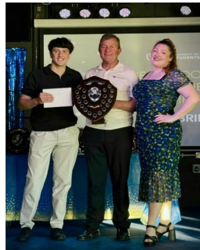
University of Chichester – Football Freshers Award