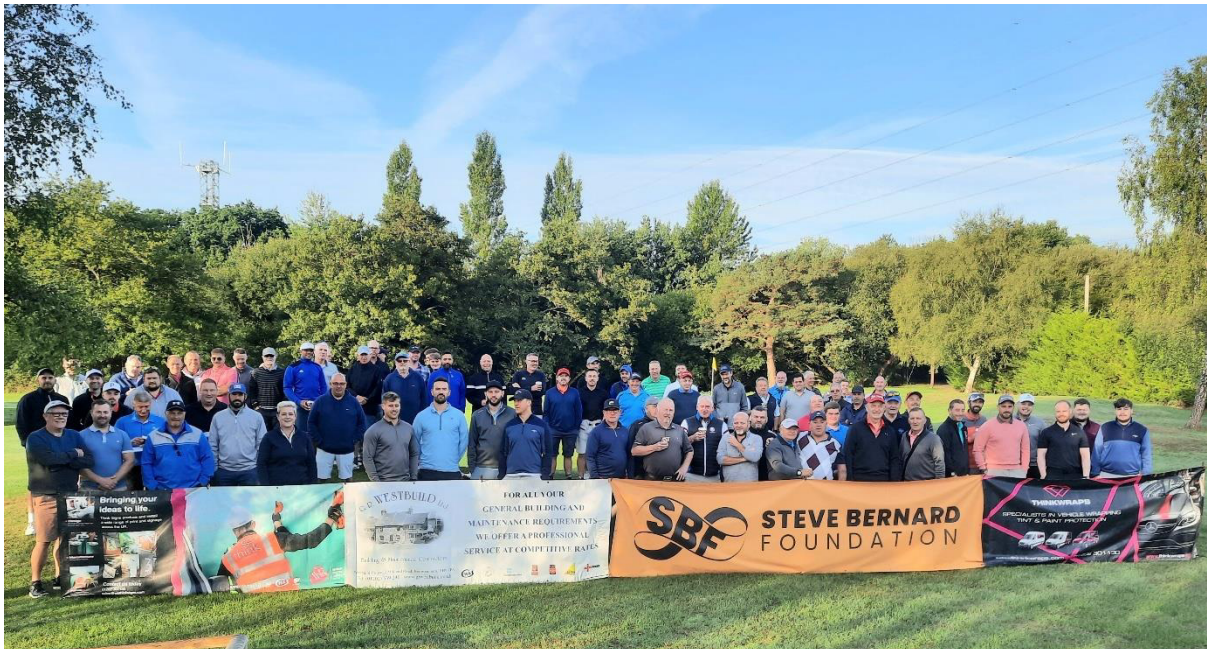
Gary Beale Memorial Golf Day

Pictures of some of the events, are shown below: