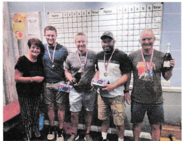
“The Villains and Spoons” Skittles Champs