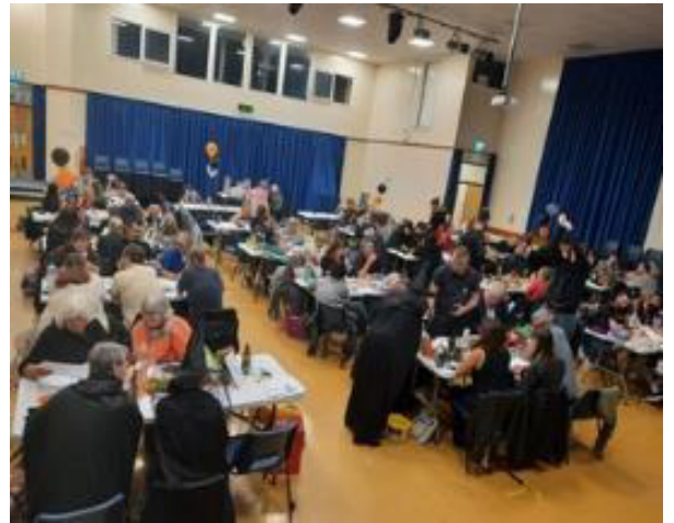
Hurn Bridge Quiz Night