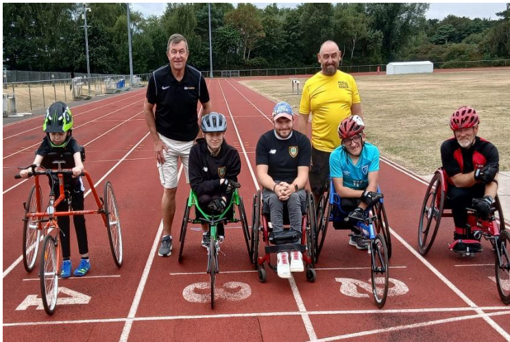
Poole Athletics Team – Racing Wheelchairs

Some pictures of the people and group's we have supported are below: