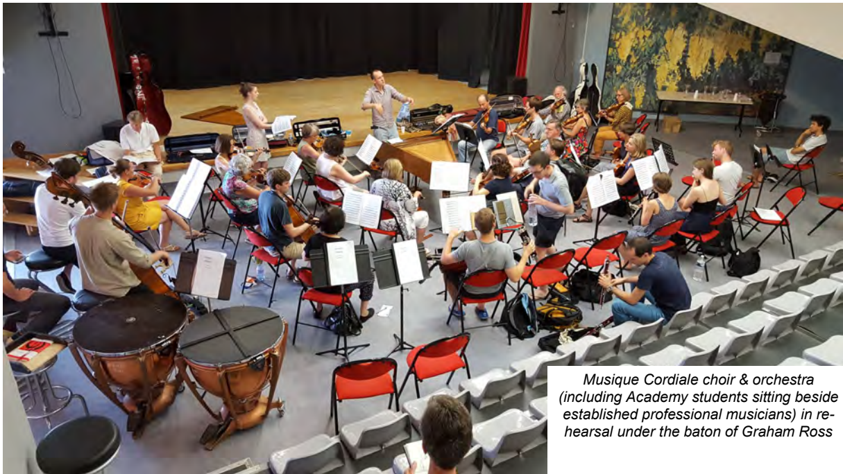
Musique Cordiale choir & orchestra (including Academy students sitting beside established professional musicians) in rehearsal under the baton of Graham Ross