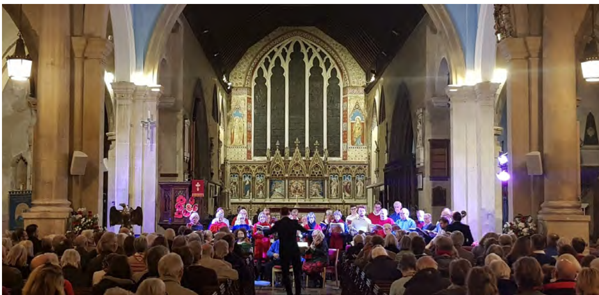
Summer festival concerts in Kent in 2020-2022 at a time when travel and the organisation the festivals and the academy in France was severely constrained, particularly indoors.