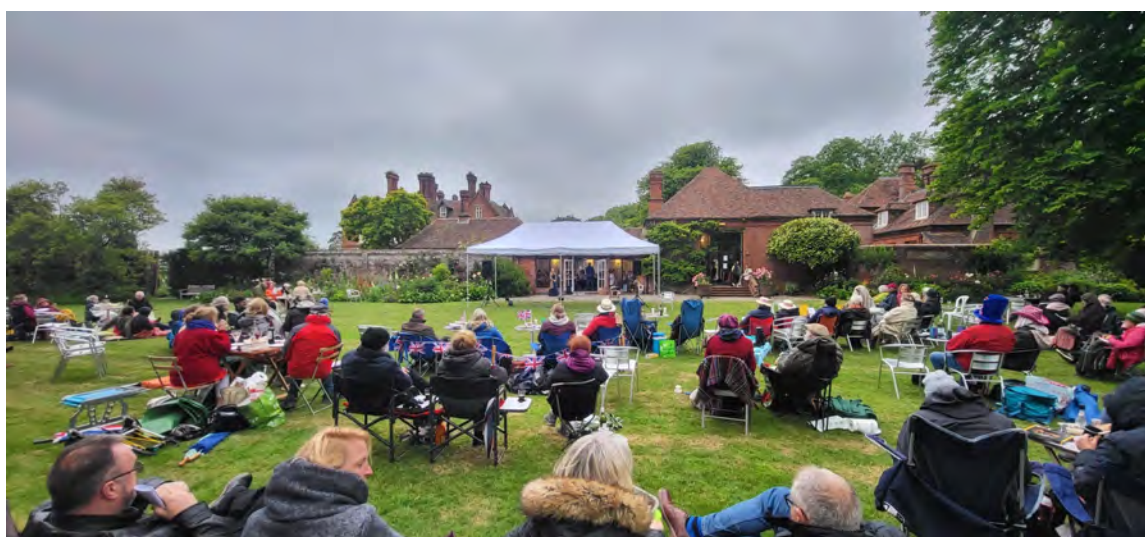
Summer 2022 Concert en pleine aire in Kent