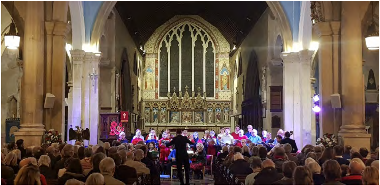
Summer festival concerts in Kent in 2020-2022 at a time when travel and the organisation the festivals and the academy in France was severely constrained, particularly indoors.