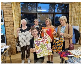
Summer Craft Evening