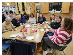
Christmas Craft evening

Our main Fundraising activities were a Games Night where we held a Beetle Drive and played Bingo, with much competitive fun and laughter, Sing a Long Film Nights with Pop Corn and Ice Cream, fabulous Craft Evenings in March, July and November which brought in many people from the wider community and produced some lovely pieces of work, including some by people who had never used a sewing machine, or threaded a needle before.