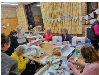
Spring Craft Evening

During 2023 we raised £7396.25 for Church Funds, and we had a lot of fun, laughter and fellowship while doing so.