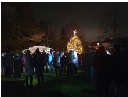
Carols on the Hatch ( above )