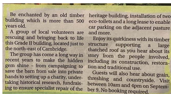
Tithe Barn in Landbeach – Heritage Open Day – Cambridge News 4 September 2023