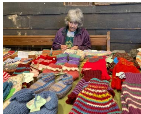
Country Market in the Barn – diverse home-made produce and products are on offer