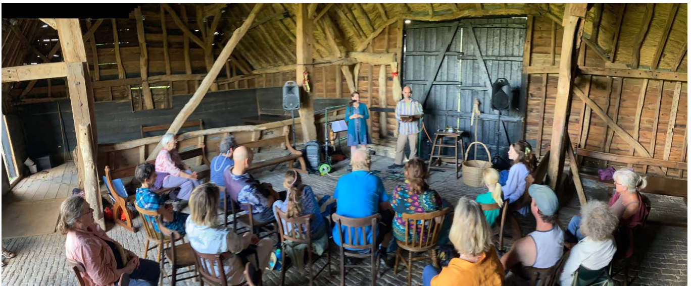
The Australian Duo performs in high summer 2023

Access is open to anybody – local, regional and visitors from further afield and membership is open to anyone.