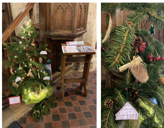
Christmas Tree Festival – at/by our neighbours All Saints' Church in Landbeach with contributors requested to use natural and recyclable decoration