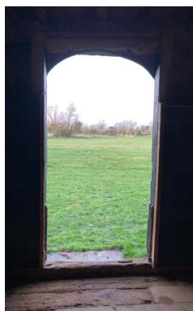
The 'Little Door View'