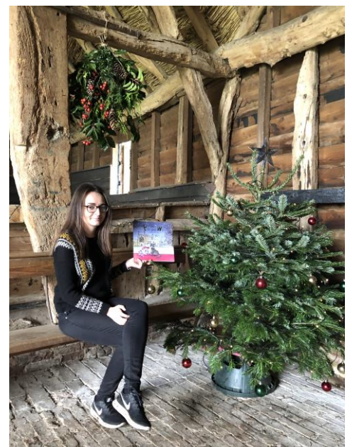
Events and learning at the Tithe Barn in 2020